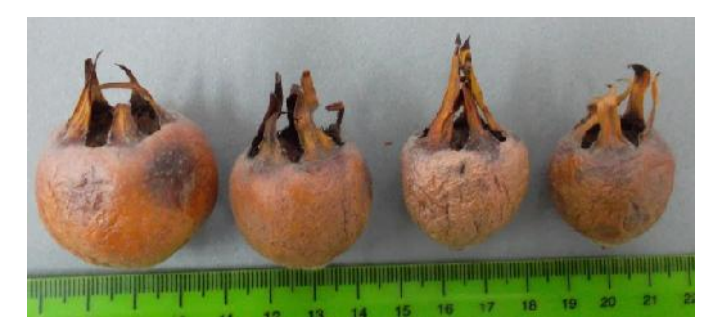
Figure 4. Water losses and deformation of fruits.

Table 2.Changes in biochemical characteristics of medlar fruits during the ripening period