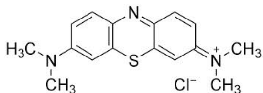
Figure 1. Molecular structure of Methylene Blue

One of the most commonly used chemical for dyeing cotton, wood and silk is Methylene Blue (MB) [4]. Molecular structure of MB is illustrated in Figure 1.