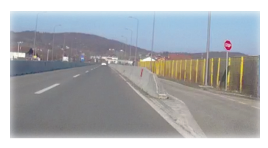
Figure 7. Unprotected new jersey barrier (M16.1)

New Jersey barriers are present only on the road reserved only for the traffic of motor vehicles M16 Banja Luka - Klašnice. Their function is to physically separate the driveways. In the majority of cases, one line of these barriers is enough but there are two lines on the M16 path for reasons that are not defined. Roadside disturbances on this section are largely adequately protected, but the beginning of the new jersey barriers are a problem if a moving vehicle hits one of them. Any beginning is not protected in any measure, and it also represents a sort of a catapult for a vehicle in case of a collision.