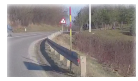
Figure 4. Open start of the rebound fence (M16.1)

The frontal open beginnings of rebound fences pose a major problem in the entire observed section. The example from Figure 5. shows the open start of the rebound fence on the road section Klašnice - Prnjavor (M16.1).