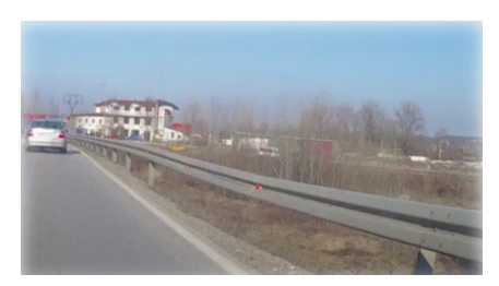
Figure 5. Poor maintenance (M16.1)

The approaches and the fences on the bridges are also one of the critical points on the observed section. There are openings between the protective fences on the bridges and the frontal rebound fences. And in this case, the ending of the rebound fence is in most cases open. As far as the protective fences on the bridge are concerned, they are mostly in poor condition or not present on one or both sides. The approaches to the zones of the bridges are not adequately protected. The rebound fences, if any, do not protect vehicles from possible landings in slopes in the zone from 20 to 50 meters before the bridge. They are placed before the beginning of the bridge or are not at all positioned.