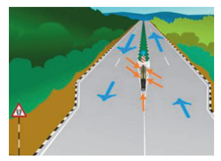
Figure 11. M16 example situation

On the road reserved only for the traffic of motor vehicles M16 there are several New Jersey barriers whose beginnings are not protected in any measure and some of them have already traces of vehicle imapets. Since speeds on this road are more than 100km/h, adequate protection and prevention of catapulting vehicles in the event of a collision is a must have thing. [11]