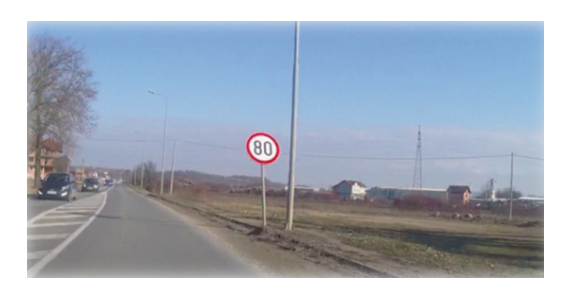
Figure 2. Iron poles in the speed limit zone of 80km/h (M16.1).

In Figure 3. we can see an example from a real life situation. That even if the speed limit is 80km/h the poles are located very close to the edge of the driveway and extend on the right and left side of the road to the entire length of the segment of the specified speed limit. [7]