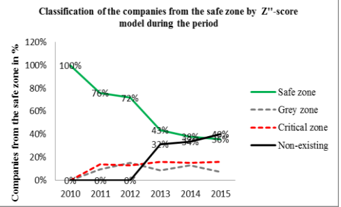
Graph 2. Classification of the companies from the safe zone according to Z' and Z'' model by years Класификација предузећа из безбиједне зоне према Z' и Z''скор моделима по годинама