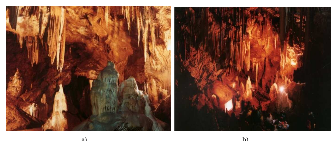
a) Figure 2 The interior of the cave Orlovaca - Source: Pecelj M, and group of authors, 2006 a) speleothems in Romanija chamber, b) Galerija and Romanija chambers

The aesthetic value of this object enhancing and enriching beautiful draperies provide the perfect ambience design. Basins of different sizes filled with water, provide a complete inventory of the cave ornaments. In addition to the cave ornaments, special tourist motive in caves are underground streams, rivers, lakes, rare forms of cave flora. For these reasons, Orlovača cave is one of the largest and most beautiful cave system in Bosnia and Herzegovina and Republic of Srpska.