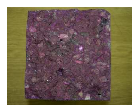
Figure 10 The carbonation process on new generation concrete after one year is not visible

The size of the layer that captured the carbonation process on a one-year-old concrete sample was measured. On sample can be seen that the process of carbonation did not affect the concrete of new generation, figure 10, which is a clear proof that these concretes are "closed" considering air entrance. This could be of particular importance to the global concrete construction industry in terms of solving the carbonation problem.