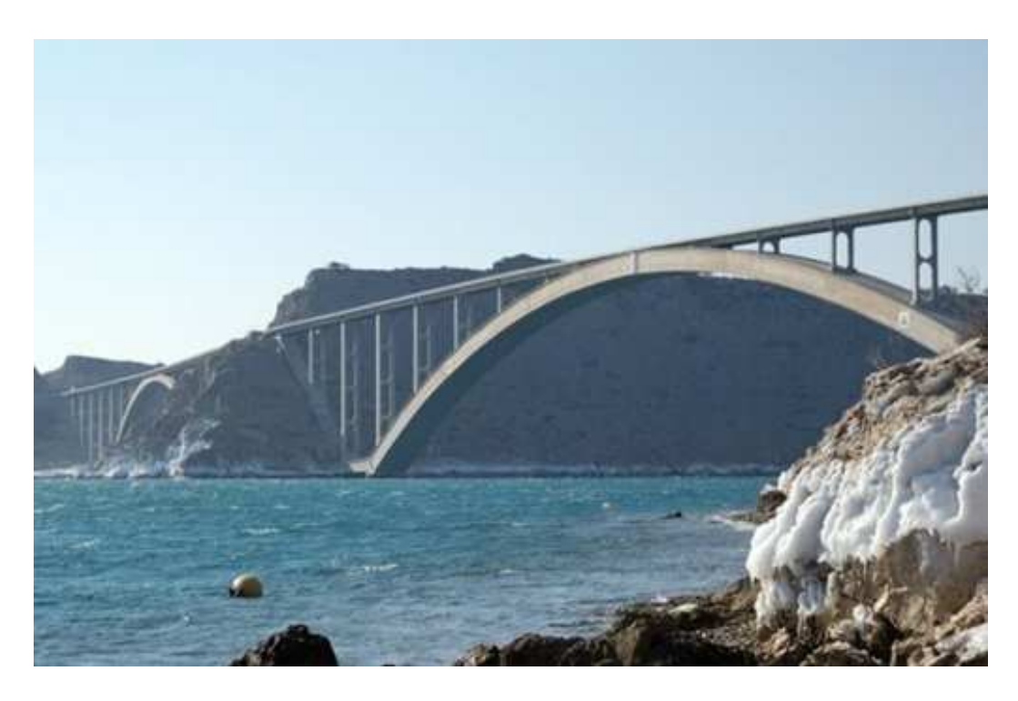
Figure 2 Large concrete arch bridge near the island Krk in Croatia whose lifetime should be several hundred of years

In our region exist large hydro technical objects like hydro power plant dams whose construction is extremely expensive and demanding, figure 3. These objects have to have high level of security and durability because any endangerment of stability can have catastrophic consequences for people and material goods in the downstream part.