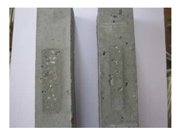
Figure 11 Resistance to wearing of ordinary concrete – left sample and new generation concrete of ultra high strength – right sample

Wear resistance was also measured at new generation concrete, figure 11. It can be seen the trace of worn out part due to wearing (valued as I class) and it is for 40% narrower for ultra high strength concrete (right sample) in relation to trace due to wearing (valued as II class) of sample of ordinary concrete (left sample). Practically, wearing of ultra high strength concrete is only present on cement rock with the finest aggregate grains. This is further evidence of the exceptional strength of this concrete, which has hardness at the level of hardness required for resistant special concrete of industrial floors.