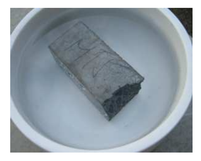
Figure 9 Measuring of water absorption on concrete of ultra high strenght, sample M 15

Measured volume mass of concrete in fresh state of 2665 kg/m<sup>3</sup> shows us, in relation to projected volume mass of fresh concrete, that maximally good embeddedness is achieved where the quantity of pulled air is smallest than 1%. Measured water absorption of hardened concrete after twenty eight days is u = 4.35%, figure 9. Water absorption in ordinary concrete is of high quality of 5 to 6% and goes even up to 7% at ordinary concretes of weaker quality.