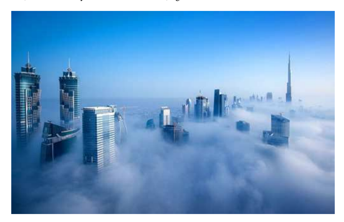
Figure 1 Buildings that are become a trend and need in cities with millions of inhabitants

are no large cities and the need for construction of high buildings does not exist. Here, however, exist the need for construction of other large objects such as bridges and viaducts because of the presence of rivers, mountain valleys and islands on the sea, figure 2.