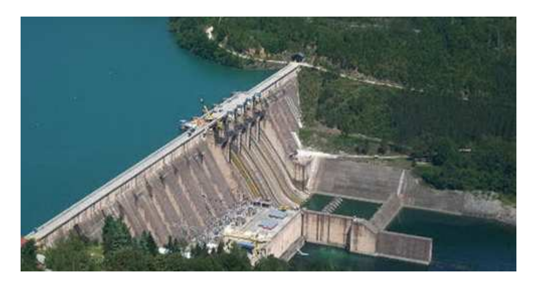
Figure 3 Hydro power plant on the river Drina

Concretes so far with the strength of several tens of megapascales (MPa) are no longer reliable enough as far as resistance and durability. Because of that exists a justified need for introduction of concrete of ultra high strength into production and on the market at the construction of capital and expensive objects. Authors of this work predict that there are also other reasons that in the near future could have an effect on the use of such concretes and on other objects and those are aggressive chemical environment and corrosion that can impact regular concrete. The most common form of concrete corrosion is carbonation [1]. Today huge amount of funds are used on sanation of concrete objects, all around the world. In particular, this form of corrosion has been present lately as the level of harmful emissions of CO2increases. Carbonation is a process where CO2 from air enters into concrete and has a chemical reaction with lime Ca(OH)<sub>2</sub> whereby are formed limestone CaCO<sub>3</sub> and water H<sub>2</sub>O.