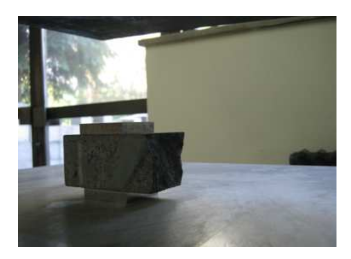
Figure 8 Investigation of comprehensive strenght at concretes of ultra high strenght on sample M15

On figure 8 is seen that the investigation was conducted on small samples 4x4x16 cm. Such small test bodies were chosen for simple reason because laboratory press can produce the force up to 2000 kN that is not sufficient to determine the strength on trial bodies 15x15x15 cm.