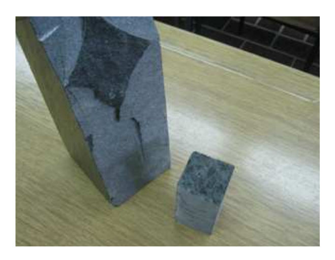
Figure 7. Concrete sample M15 and rock Gabbro under the name Nero Zimbabwe From which was made aggregate for concrete

Research was conducted on Faculty of Civil Engineering in Subotica in the first part of the year 2013. Aggregate for test laboratory production of new generation concrete was done from natural rock of African gabbro under the name Nero Zimbabve which has high strength on pressure that is 286 MPa, figure 7. The measured water absorption of this aggregate is 0,25 %. Volume mass is 2950 kg/m<sup>3</sup>.