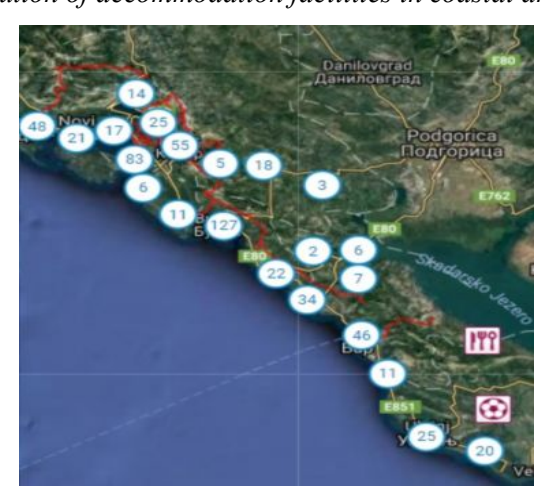
Figure 1: Distribution of accommodation facilities in coastal area and Cetinje

Second stage was to work on formal introduction and advocacy of the aforementioned certificate schemes, through number of presentations and direct interviews with interested accommodations' owners and managers. The activities started in March 2016, in 6 coastal municipalities (Herceg Novi, Tivat, Kotor, Budva, Bar and Ulcinj) and Cetinje, in central region of the country. The invitees were 200 registered accommodations with 3, 4 and 5 stars. The source for invitees was Central Tourism Register, held by National Tourism Organization of Montenegro.