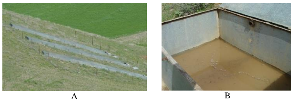
Fig. 3. A view of standard erosion plots (A) and a view of runoff and sediment collected in plot output reservoir (B).

Three erosion plots with the area of 22.13 \times 1.83 m (dimension of Universal Soil Loss Equation plots) were installed in each western, northern and eastern slopes of both control and treated sub-watersheds. The surface runoff and soil loss at the output of all 18 plots were collected and measured after each rainfall event which led to runoff (Fig. 3).