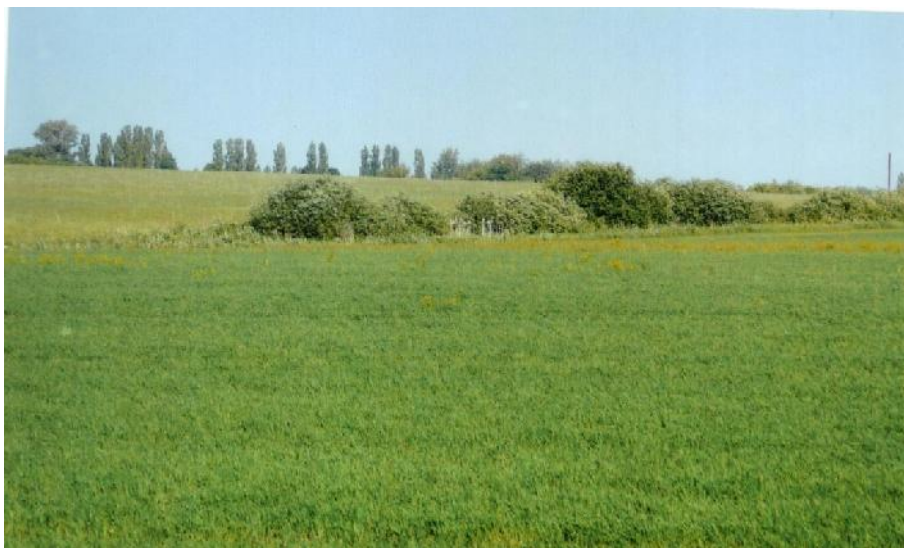
Figure 2. The consolidation of hollows with trees and shrubs. Belgorod district of Belgorod Region

2. The increase in the total forest covers of the territory. This is achieved through a range of activities, which includes the creation of protective forest strips on arable land, the creation of forest strips near hollows and gulleys (Volkov, 2005), shrub scenes development, complete forestation of ravines.