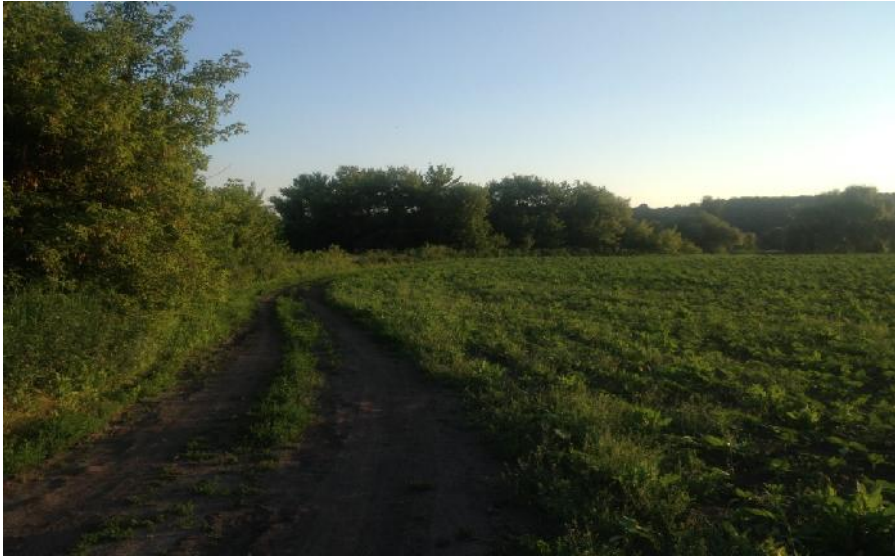
Figure 3. Contour tillage, Voronezh region

6. Development of micro wild reserves for wild fauna, ornithifauna, and entomological micro wild reserves. Example of entomological reserve is presented in figure 4.