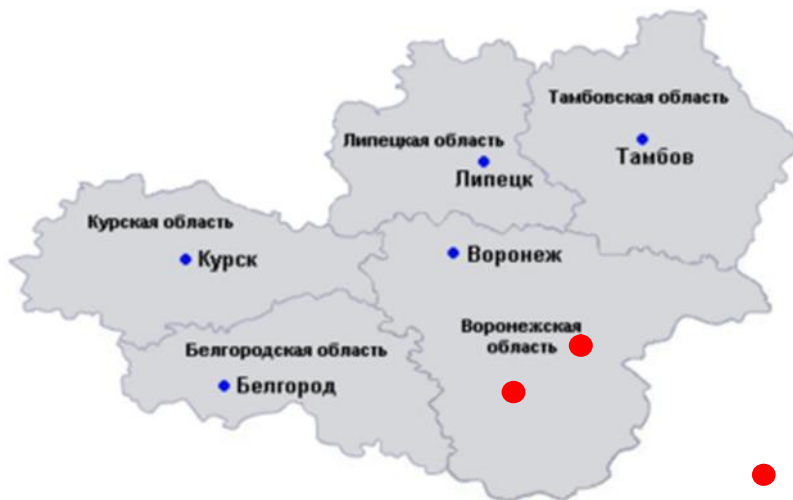
Figure 1. The Central Chernozem region of Russia

The agro landscapes in the agricultural enterprises of the Central Chernozem region of Russia are studied. Farms where agricultural landscapes elements increasing their environmental sustainability are introduced, are located in Kantemirovsky district, Voronezh Region (49° 40' N, 39° 51'E.), Chernyansky district, Belgorod Region (50°55' N, 37°48' E), Belgorod district of Belgorod Region (50°36' N, 36° 36' E), figure 1.