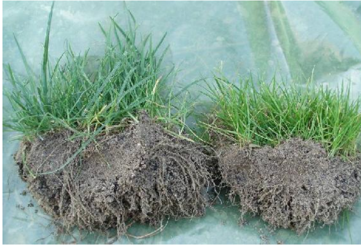
Fig. 2. Shoot and root growth of mycorrhized (left) and nonmycorrhized (right) turf grass after 8 weeks of seeding.