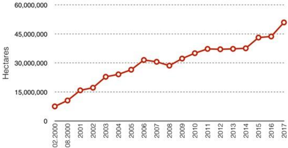
Figure 1. Certified organic agriculture hectares have grown at nearly 12% per annum for the past two decades but currently account for only 1.1% of world agriculture (Source: (Paull, 2017a)).