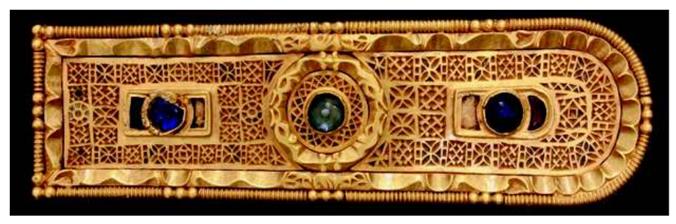
Picture 1: Avar belt (detail), VII century, illegally excavated on the site of Sirmium

A golden Avar belt was discovered by accident in July 1992 in a field near the village of Divoš near Sremska Mitrovica (Sirmium), at a depth of two meters, during unauthorized archaeological excavations, with the use of metal detectors (Popović, 1997). Being discovered, it was very quickly sold again through an intermediary to an antiques dealer in Belgrade. According to the estimates of archaeologist Dr Ivana Popović from the Institute of Archaeology in Belgrade in 1997, its market value would amount to around one million euros. The Avar belt was discovered thanks to the conflict about the belt between two dealer networks which wanted to come into its possession illegally. The Department for Combating Organized Crime of the Ministry of Internal Affairs RS arrested the main participants and accomplices, and charges for crimes of illegal trade, tax evasion and unauthorized archaeological excavation<sup>8</sup> were filed against them. The trial ended with a conviction on three years' probation for each of them.