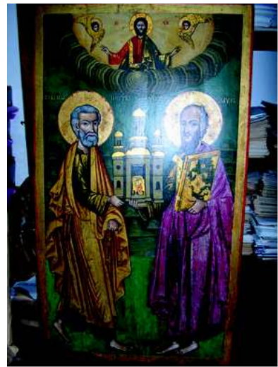
Picture 2 : The throne icons of the iconostasis of Church St. Nicholas in Sibač<sup>9</sup>

Art thieves in Serbia also target relics. The term relic in the broadest sense means 'remains' which are respected as sacred – the relics of martyrs and saints (the whole body or its physical remains) as well as the items which the holy persons were in contact with (weapon they were killed or tortured with, clothing, etc.). In October 2003 three Bulgarian citizens stole the miraculous relics of Saint Cosmas and Damian from the Sopoćani monastery (transferred to Sopoćani in 1999 after the demolition of the Zočište monastery in Kosovo). The stolen relics were found by the police and returned to the monastery. Bulgarian citizens were deprived of their liberty and they were charged with a criminal offense of grand larceny. The offender P. P. was sentenced to six months, P. V. to three months and M. M. to one year in prison. In the same year, the relics of St. Haralampije from the Church of the Nativity of Christ's in the town of Pirot were stolen, but the theft has not been solved yet. Unidentified perpetrators stole the reliquary with the relics of St. Paraskeva from the St. Paraskeva monastery in Petkovica near Šabac in 2006.