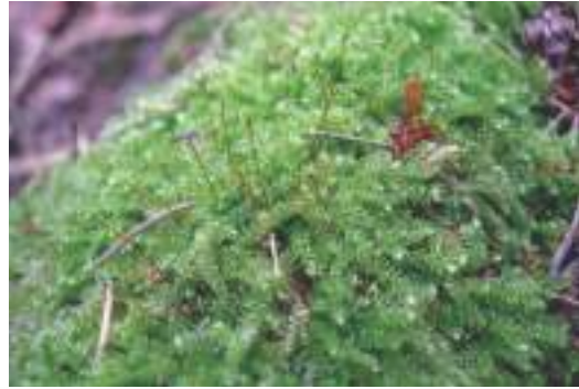
Figure 9. / Slika 9. Herzogiella seligeri

According to the Red data book of European bryophytes (ECCB, 1995). It is known from all the Balkan countries and new population are being discovered, for example in Serbia (Papp et al., 2014; Papp et al., 2016a), Macedonia (Papp & Erzberger, 2012; Papp et al., 2016b), Croatia (Papp et al., 2013a, 2013b; Alegro et al., 2014).