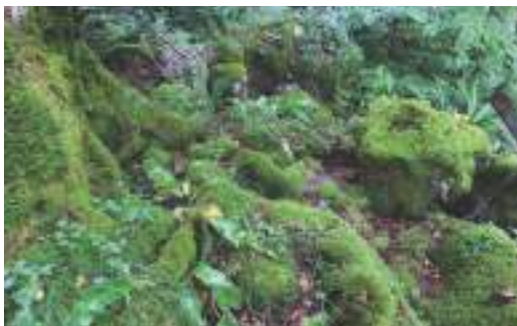
Figure 4. Bryophyte synusias at shaded rocks and tree base at Hršova vrela in Sutjeska river canyon / Slika 4. Sinuzije na zasjenjenim stijenama i osnovi drveća na Hršovim vrelim u kanjonu Sutjeske