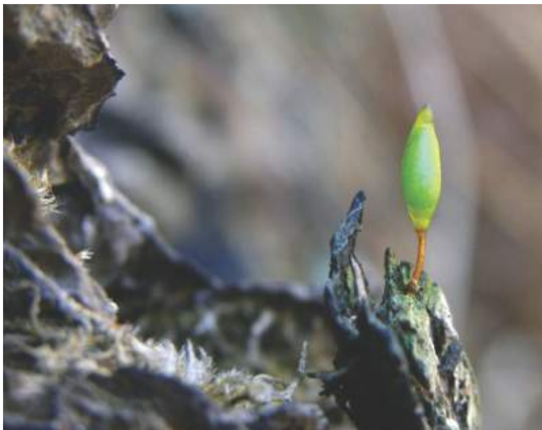
Figure 10. / Slika 10. Buxbaumia viridis

Specific diversity of microclimatic conditions, variety of bedrock and more importantly, well preserved areas without large human influence, had led to high diversity of microhabitats suitable for bryophytes. Hence, canyons and virgin old forests surrounding the rivers are rich in diversity of bryophyte species, many of which are being rare and even European red listed. It is expected that further research will bring new important data on bryophytes, many of which are rare and even threatened species, as well as many new records for the country. Considering all of above mentioned, this area surely represent valuable and important area for bryophytes.