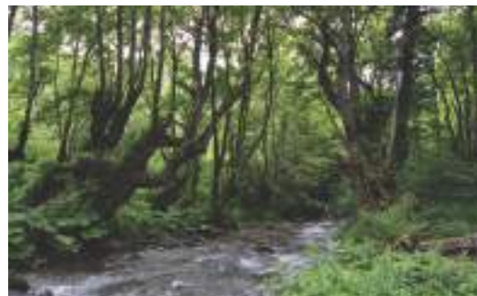
Figure 5. Riverine galleries of Alnus glutinosa in Hrvčavka valley / Slika 5. Trakaste galerije crne jove u dolini Hrvčavke