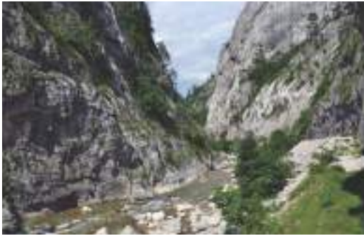
Figure 2. Vegetation of limestone cliffs at Vratar in Sutjeska river canyon / Slika 2. Vegetacija krečnjačkih stijena u Vrataru u kanjonu Sutjeske