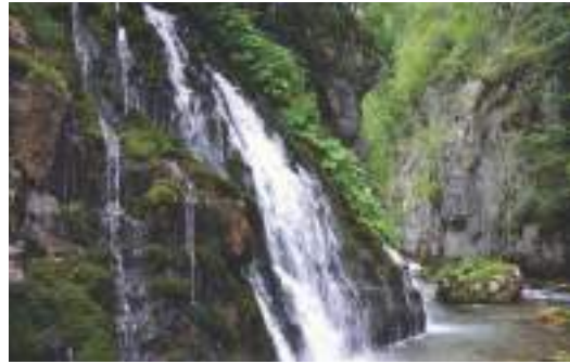
Figure 3. Tufa formations at Skakavac in Hrvčavka river canyon / Slika 3. Sedrene naslage na Skakavcu u kanjonu Hrvčavke