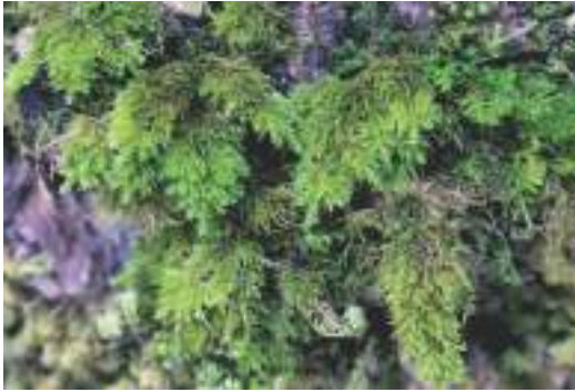
Figure 8. / Slika 8. Leptodon smithii