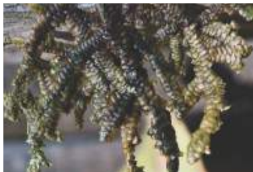
Figure 7. / Slika 7. Porella arboris-vitae

Shaded limestone rocks and boulders along riversides represent habitat suitable for many species. Amongst others, two sub-Mediterranean species, Porella arboris-vitae (Figure 7) and Cololejeunea rossettiana , which were previously, reported as new records for the country (Pantović et al., 2016). C. rossettiana was recently reported first time for the Macedonia as well (Papp et al., 2016b). Atlantic-Mediterranean species Lepthodon smithii (Figure 8), was found growing on limestone rocks, as well as on old and large trees along riversides. This not very common European species was re-discovered in Bosnia and Herzegovina after more than fifty years, and it is red listed in some countries, e.g. Hungary (Papp et al., 2010) and Romania (Ștefănuț & Goia, 2012).