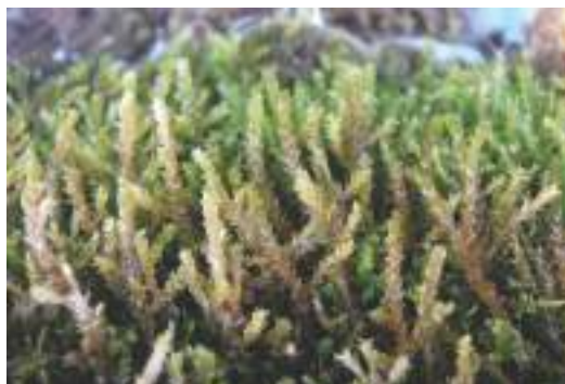
Figure 6. / Slika 6. Platyhypnidium riparioides

Along river and streamsides saxicolous aquatic, riparian species dominate, making specific assemblages in running water, on nearly vertical riversides, and wet rocks by the stream. These are temperate Palustriella falcata , Platyhypnidium riparioides (Figure 6), the sub-Mediterranean Cinclidotus species ( C. aquaticus , C. fontinaloides and C. riparius ), as well as rare European species Fontinalis hypnoides or boreal species like Hygrohypnum luridum and Schistidium rivulare . Associate hygrophytes species are Atlantic, sub-Mediterranean Fissidens serrulatus recently reported for the first time for Bosnia and Herzegovina, subboreal Brachythecium rivulare and temperate B. rutabulum and Cratoneuron filicinum .