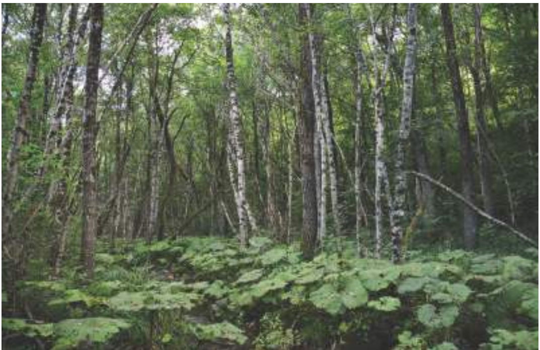
Figure 4. Hygrophilous riparian forests of Alnus glutinosa and Salix fragilis in the Sutjeska river valley / Slika 4. Higrofilne šume crne jove sa krtom vrbom na položjima uz rijeku Sutjesku