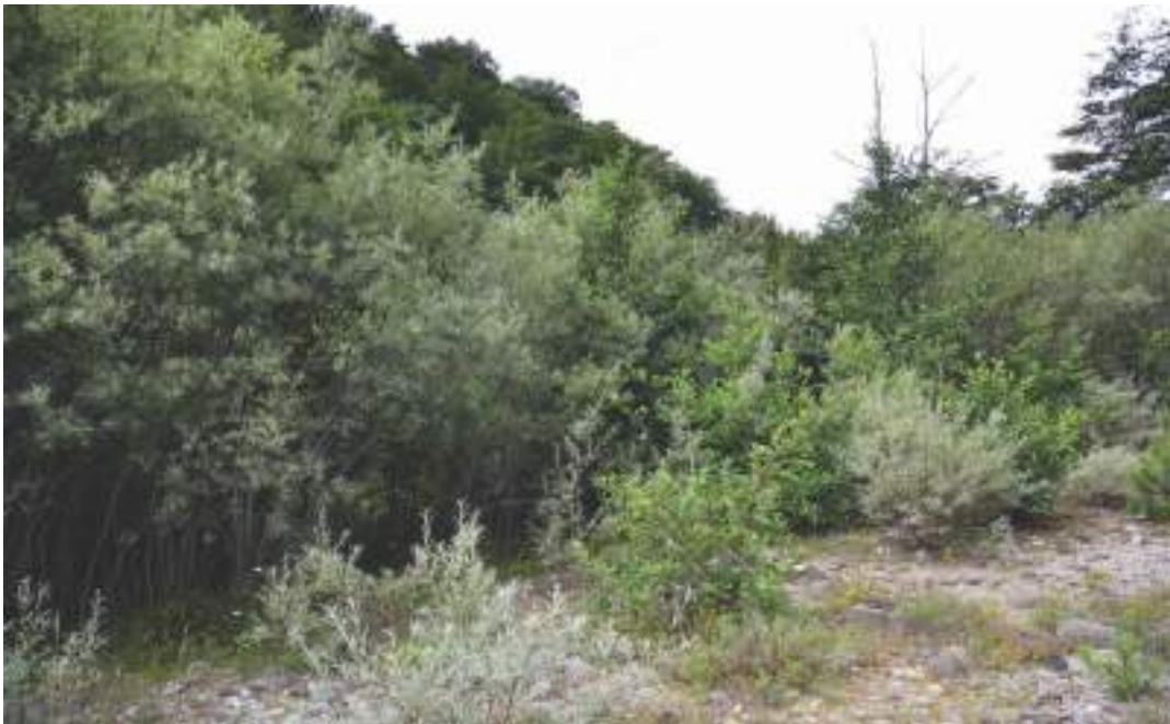
Figure 7. View on thermo-mesophilous stands of Salix elaeagnos and Ostrya carpinifolia from their edge in the Sutjeska river valley / Slika 7. Pogled na sklopljene sastojine sive vrbe i crnog graba u dolini Sutjeska sa njihovog ruba

Group 5 is represented by closed canopy thermo-mesophilous scrub of Salix elaeagnos and Ostrya carpinifolia developed over gravel bars which can be several meters deep and sometimes quite away from the river bed (Figure 7). They are flooded only during the highest and strongest spates, but as Salix elaeagnos is able to anchor itself in the gravel with strong tap roots it keeps the deposits on place and enables the less resistant elements to colonize the soil. These gravel bars are at least one meter higher than middle summer water which causes dry periods, but bitter willow can withstand this dry periods by following the retreating water with its roots which branch out horizontally (Ellenberg, 2009). This closed canopy scrub is a part of natural successional series which goes from open gravel bars with annual plants and bitter willow saplings, over semi open formations with young bitter willow shrub. Floristic composition