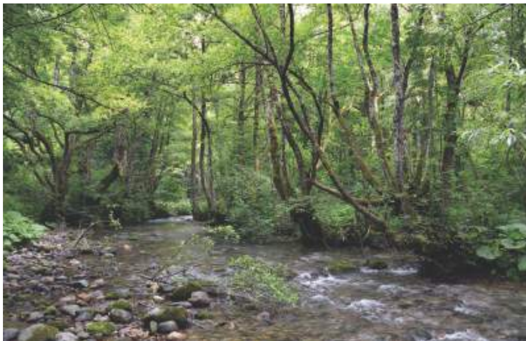
Figure 5. Mesophilous riparian forests of Alnus glutinosa along lower reaches of the Hrčavka river / Slika 5. Mezofilne šume crne jove u donjem dijelu Hrčavke