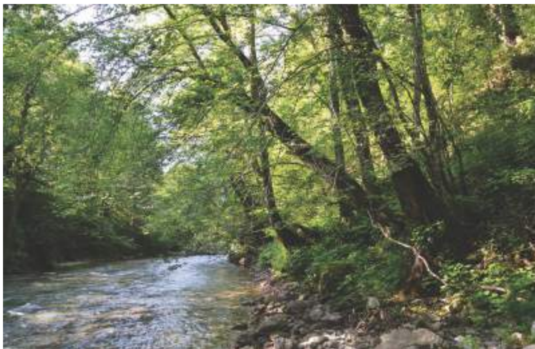
Figure 6. Mesophilous streamside formations of Alnus glutinosa and Adenophora liliifolia alongside the Sutjeska river / Slika 6. Mezofilne trakaste sastojine crne jove sa mirisnom žljezdačom uz Sutjesku