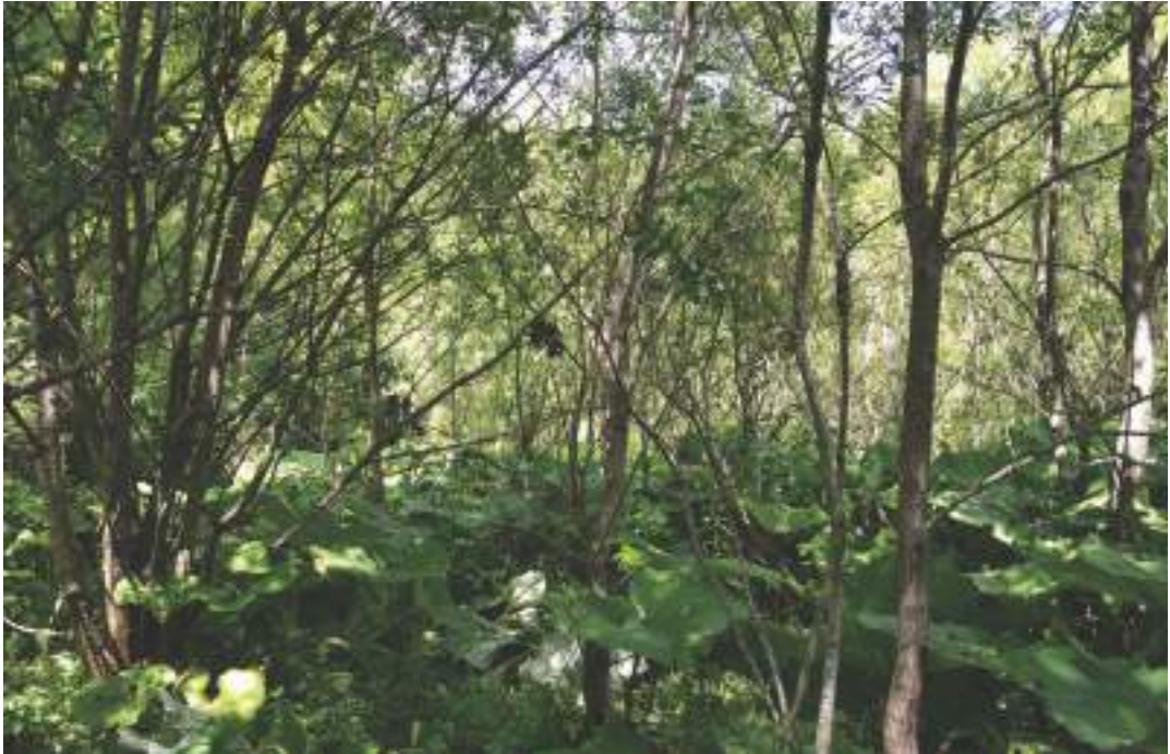
Figure 3. Nitrophilous formations of Salix eleagnos and S. caprea alongside the Hrčavka river / Slika 3. Nitrofilne šikare sive vrbe i ive uz Hrčavku