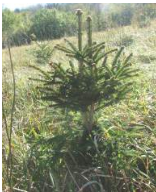
Figure 1. Damaged seedlings / Slika 1. Oštećene sadnice

Data were statistically analyzed by using the appropriate software packages: Microsoft Excel (ver. 2010) and Statistica (StatSoft Inc, ver. 7.0). The basic statistical parameters were calculated: arithmetic mean and standard deviation at the level of: blocks, population and half-sib lines. The differences among the survival rates at the level of blocks, populations and half-sib lines were tested by ANOVA ( p < 0.05 ), and post-hoc Duncan's multiple range test.