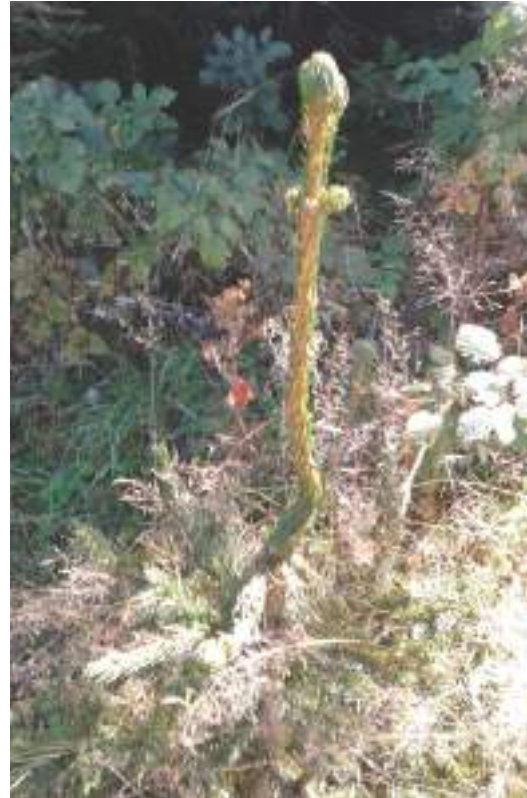
Figures 2-3. Damaged seedlings / Slike 2-3. Oštećene sadnice