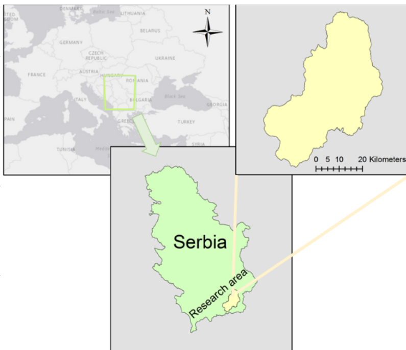
Figure 1. Research area / Slika 1. Istraživano područje

Considering climatic conditions, the investigated area is situated on the Mediterranean and Continental climate with a mean annual air temperature of 10.9 °C and a total annual precipitation of 672 mm (RHMZ 1949–2015). Considering the vegetation at altitudes up to 600 m a.s.l. the association of Turkey oak and Hungarian oak ( Quercetum frainetto-cerris ) is the most com-