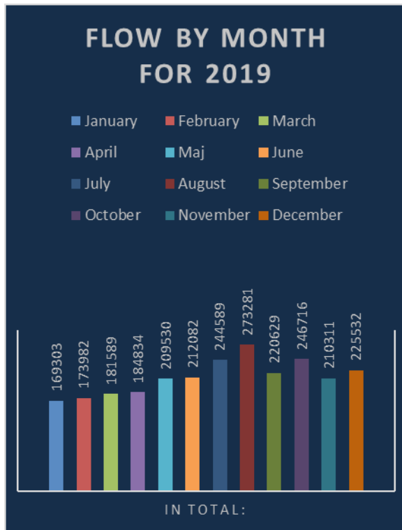
Figure 3: Chart of flow request sizes during 2019

The analysis of the obtained results was performed according to the total flow of vehicles (input + output) per month and according to the total annual flow of vehicles.