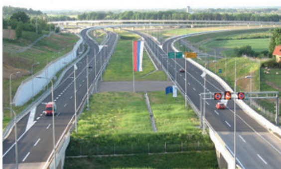
Figure 2: Highway E-661 (Freelance artist, 2013)

The conducted research included the counting of traffic during four years, after the transition to a closed charging system on the entire network of highways in the Republic of Srpska. The research was conducted in the period from the beginning of November 2019 to the end of December 2022. The data were collected from the Public Company " Republic of Srpska Motorways", from the Center where all traffic data on highways managed by the mentioned company are stored. After data collection, a database was created in the "Microsoft Office Excel" program, in which data analysis was performed. General data analysis was performed for each month individually, as well as for each year separately.