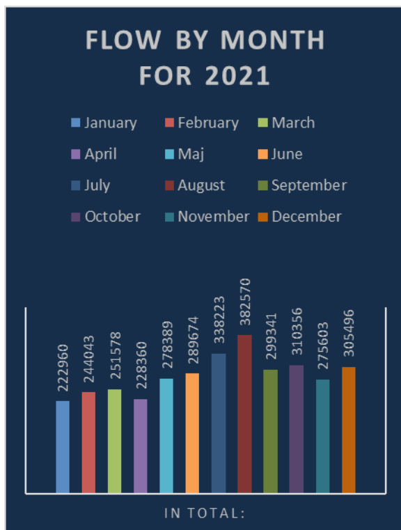
Figure 5: Chart of flow request sizes during 2021