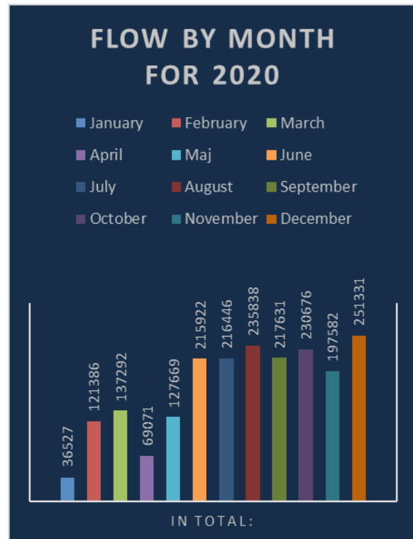
Figure 4: Chart of flow request sizes during 2020