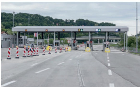
Figure 1: "Jakupovci" toll station, direction Banja Luka-Gradiška (True, 2018)

ceived as one of the stations in the closed toll collection system on the highways of the Republic of Srpska. It has six traffic toll lanes, of which one on the far right in each direction is intended exclusively for electronic tolling, the two middle lanes are exclusively used for manual tolling, while the remaining two are combined, and can be used for both electronic and manual payment. The two central lanes are reversible, and can be used for tolling in both directions if necessary, while the remaining lanes, two in each direction, are intended exclusively for vehicle movement and tolling in one direction.