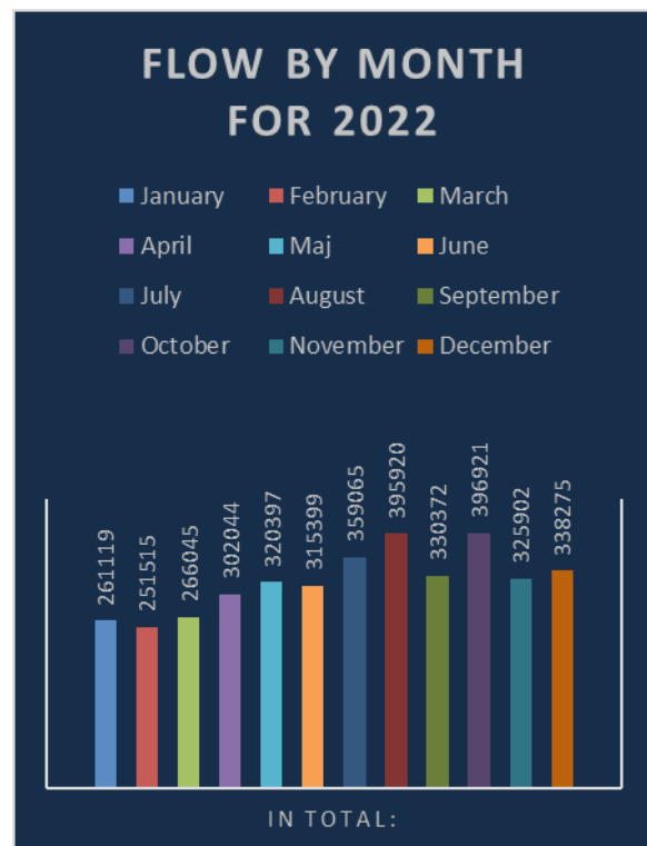
Figure 6: Chart of flow request sizes during 2022