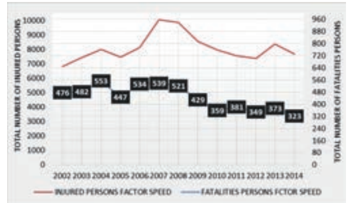
Figure 1. Speed as an influential factor by years[12]

In many developed countries traffic accident experts use in-depth traffic accident analysis in order to determine accurate share of speed as an influential factor of traffic accident occurrence, so the police do not provide information on traffic accident cause. Namely, in Republic of Serbia there are not accurate and in-detail analyses in which it is determined the number of fatalities and injured drivers caused by speed as a main factor contributing traffic accident occurrence.