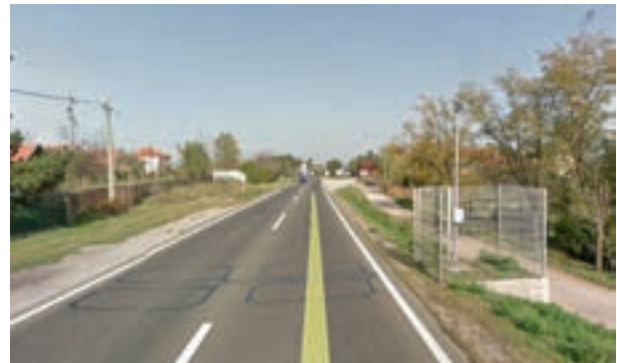
Figure 2. The spatial layout of QLTC-10C automatic traffic counter[2]

The most commonly used detectors are inductive loops. An inductive loop consists of a coil, commonly copper wire, which is put into the grooved carriageway surface, sealed and connected to automatic traffic counters located beside the road. Considering that cables are located under the road surface, there is no fraying caused by the traffic. In the case where there is only one loop per direction, that counter construction could not record speeds, but only traffic volume, vehicle presence and lane occupancy. If there are several loops, as in traffic counters in our examples, it is also possible to record vehicle speed on the basis of distance travelled and real time provided by server.