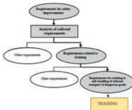
Figure 4. Improvement of safety by education

The proper training is one of the possible preventive measures in line. The SRPS ISO 10015:2002 standard gives the frame for choosing appropriate training as an effective way of giving answer to the needs for improvement of transport safety, as in figure4.