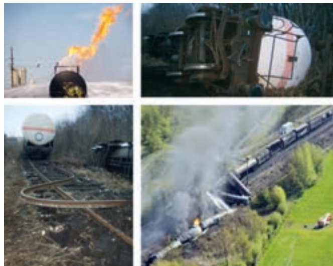
Figure 1. Disaster events during transport of hazardous materials [12]

In the dangerous cargo transport, observed from the aspect of jeopardizing members of transport process, reflects in injuries or death of people, directly linked with the dangerous cargo transport and where such injury requires immediate intensive medical intervention, longer stay in hospital and incompetence for future work. Observed by the aspect of assets and life environment, jeopardizing reflects in damaging of transport capacities, infrastructure and life environment, directly linked with the dangerous cargo transport, where such kind of damage requires larger material investments and longer halt in the unfolding of dangerous cargo transport.