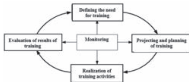
Figure 5. Basic training phases

The training process must be planned and systematically thought, to be able to give proper contribution to the railway. For improving its abilities and to achieve its goals in the sphere of dangerous cargo transport, and for the needs of conduction of such training, a general training model can be used, as displayed in figure 5.