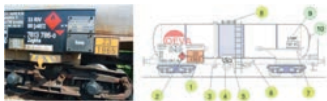
Figure 2. Marking of vehicles with dangerous cargo in the function of safe transport

The potential for jeopardizing of transport safety are all those actions which did not occur. The potential determination for endangering is embedded in the search for transport process characteristics.