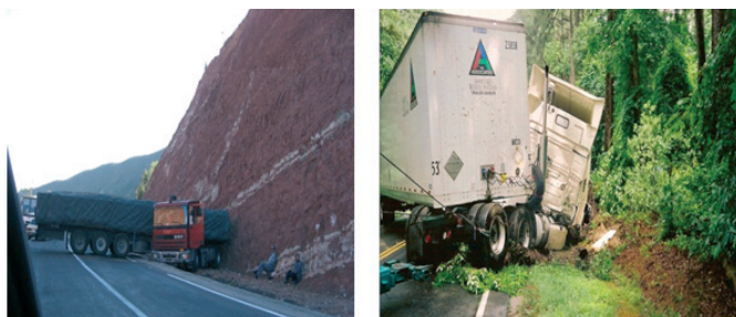
Picture 4. Jackknifing consequences

In most cases, when a trailer swing or jackknifing occurs, the driver is not able to control the movement of his vehicle or semi-trailer, as both of these occur suddenly. The consequences of these phenomena can be milder if only a part of the articulated vehicle slides off the road, or very serious if there is a contact with another participant in the traffic or a rollover of the articulated vehicle.