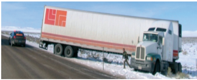
Picture 1. An example of jackknifing

The term jackknifing is based on the movement of the semi-trailer and the towing vehicle to one another, which resembles the acute angle of a folding pocket knife.