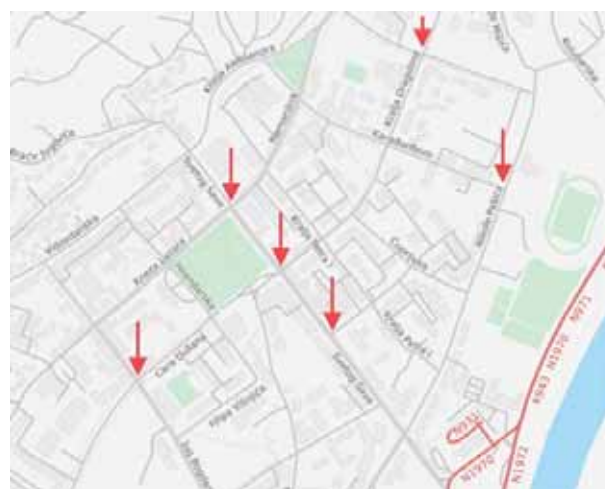
Figure 1. The considered research locations

The research was conducted in Republic of Srpska (entity of Bosnia and Herzegovina). Data were collected in six locations in the city of Doboj, Republic of Srpska. Three signalized and three unsignalized intersections were selected based on their most common type (four-leg intersections with one traffic lane in each direction) and reasonably heavy pedestrian traffic (see Figure 1). During the period of research, the behaviour of 10280 pedestrians was recorded. 753 pedestrians used mobile phones. Speed limit at these locations is general speed limit in urban areas in Republic of Srpska, 50 km/h (Law on Road Safety).