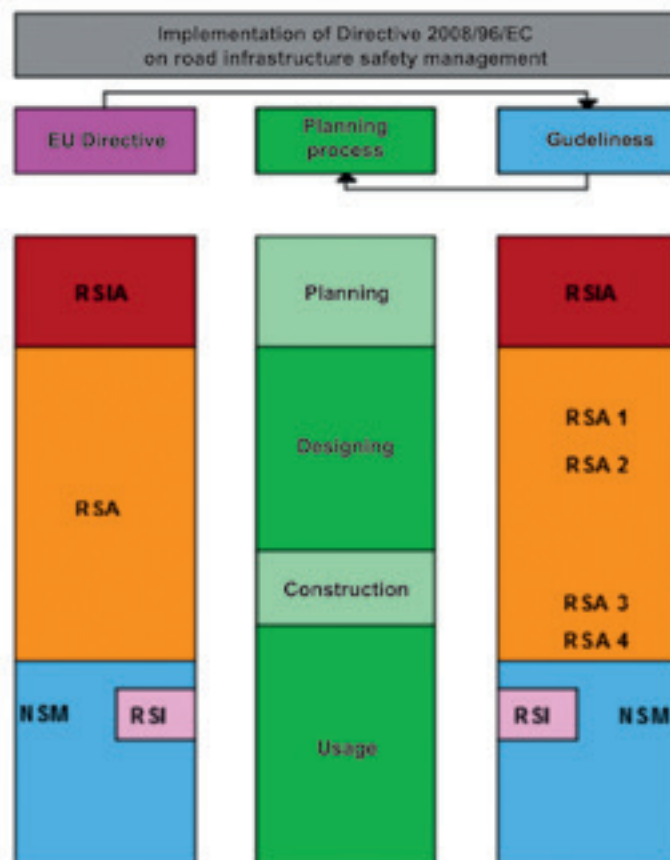
Picture 3. Tools for improving road safety depending on the stage of road use [8]

Participants of the road traffic safety audit are both the client and the auditor (the traffic safety auditor position is also recognized in the Draft addendum of the Law on Road Traffic Safety). The client orders a check and as a rule it is an institution in charge of road management (road manager). The client delivers necessary documentation to the auditor, who, after examining it and after conducting a detailed analysis, goes out into the field, identifies problems, and then produces a report on the check (Picture 4).