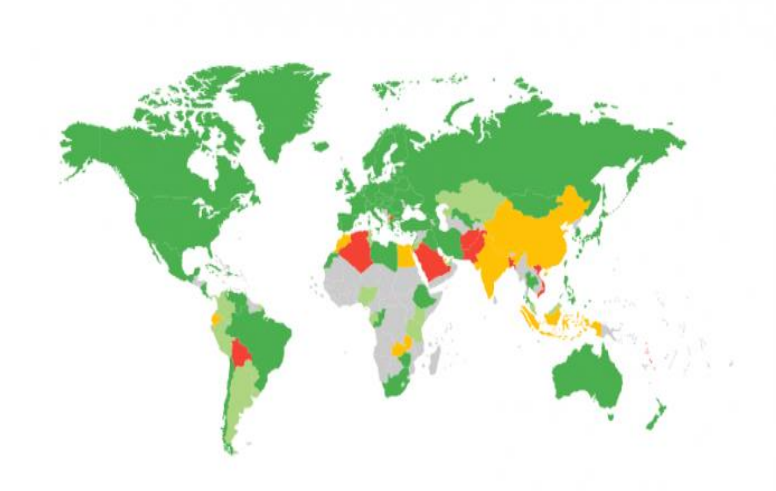
Figure 2. Regulation of cryptocurrency in the world, 2020.

In Germany with the recognition of bitcoin as one of the payment mechanisms, bitcoin was declared "private money" in 2013, by the Federal Ministry of Finance and the Federal Financial Supervision Authority, which cannot be identified with currency, foreign currency or electronic money. Japan declared the cryptocurrency legal in April 2017 by the Payment Services Act, which means that the cryptocurrency is accepted in Japan as a means of transaction. In Singapore, cryptocurrency has also been declared as a legal currency. Namely, Singapore is the first country in the region of Southeast Asia that, unlike its neighbors, accepted cryptocurrency as a mean of payment. Interestingly, in Malaysia, the use of cryptocurrency is also accepted and supported by Bank Negara Malaysia.