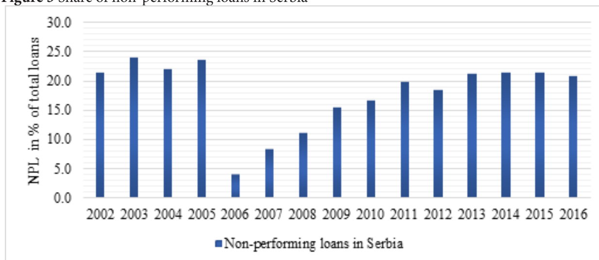
Figure 3 Share of non-performing loans in Serbia