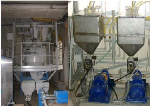
Figure 4. Example of mixing and dosing machine