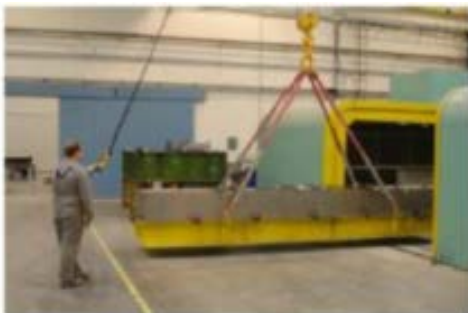
Figure 6. Vibrating table (platform)

As a general rule, large and heavy moulds use a low speed with high force, and light and table mould the opposite. When vibration is oversized, particle resonance can occur, turbulent flow occurs and the air is absorbed. In some cases, raising the temperature can help prevent it (Buksa, 2008).