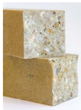
Figure 1. Cross-section of polymer-concrete product.