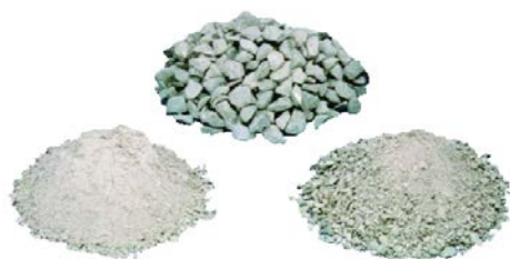
Figure 2. Fillers

Important properties in the polymer-concrete mix design shape (granulomorphism) and size (granulometry), filler distribution and filler weight fraction. Fillers for polymer-concrete adapted for engineering use consist of three to four components. The dimensions of the individual filler components range from 0.1 mm (stone meal) to 2 mm (sand) to 16 mm (gravel and stones) (Mráz and Talácko, 2006).