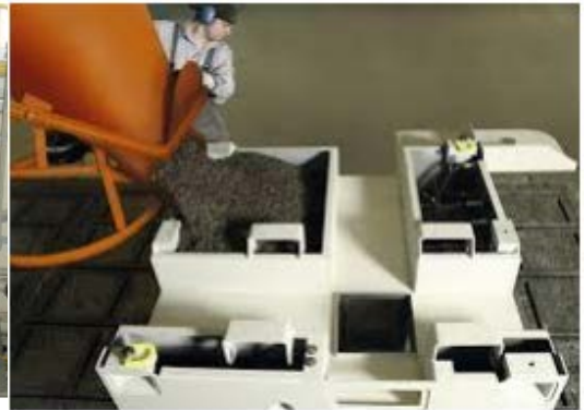
Figure 5. Molding