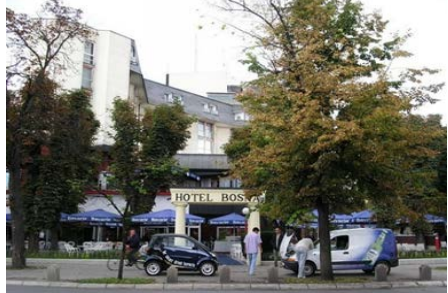
Figure 4. 5. Hotel Bosna - before and now

As a precondition for further activities in the branding process of the City of Banja Luka there is a revalorization of architectural heritage in line with the contemporary principles and analysis of possibilities of its use in the branding process. The possibilities of using building heritage and spatial wholeness in planning of place branding of the City of Banja Luka, which is different than marketing, could be implemented through four communicative action of the city as it was illustrated by Kavaratzis. All proposed actions with the aim of branding are designed for spatial dimension of the city. All these activities contribute to building an attractive image of the City of Banja Luka, a better promotion and developed brand. Tangible cultural heritage is a desirable value that to the extent that it is preserved represents a foundation for further development.