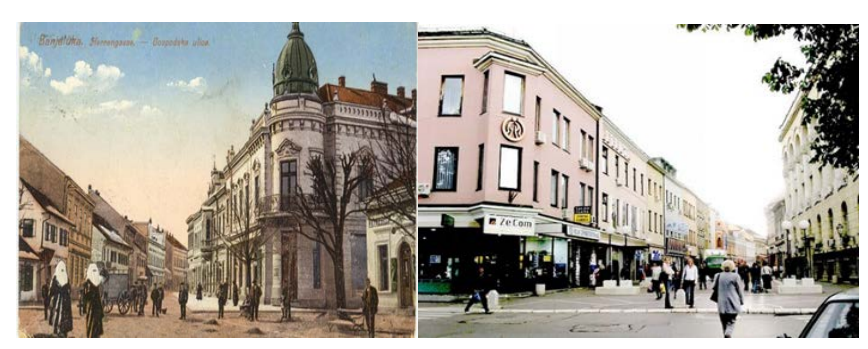
Figure 2. 3. Gospodska street - before and now

Edges are important elements contributing to the experience of the city since they represent significant communication points, whether they have extension and are developing into square or they remain as a connection of two communication directions. The most important examples are the Palas Hotel, which emphasizes a position of the cornerby dapping the ground floor, Hipotekarna Bank, which stresses a location where it is placed by its architecture, entrance and sculpture, Vakuf Palace, square at the National Theatre, Krajina Square, whose irregular shape provides a specific type of attraction and it represents a meeting point and location of important city events, and there is also a street corner where the National Assembly is placed and an old Government building as a specific spatial dominant. Furthermore, it is important to emphasize Car Dušan Boulevard, which represents a border between oriental and European part of the city. The Boulevard was formed after the stream Crkvena was shutdown. Even though this eliminated the division between oriental and European part, the presence of ambient wholeness Hanište with Ferhat Pasha Mosque has remained an important witness of oriental part of the city.