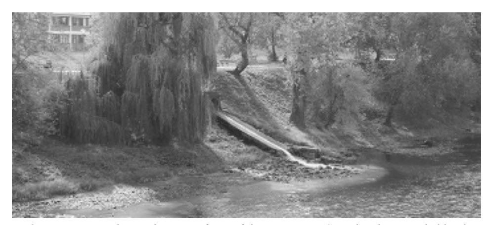
Photo 5 Banja Luka, park area in front of the University Complex downgraded by the sewage pipes

for the development of the city banks. The realized ecological values in the waterfront on one hand enable a higher degree of human recovery in the urban environment and on the other hand improve conditions for survival of other forms of life in the city. Waterfronts shaped as an integral space of natural and the built can contribute to the improvement of microclimate conditions in the city area and can help reduce and neutralize pollution and noise and visual and physical relaxation of the urban environment. / Photo 5 /