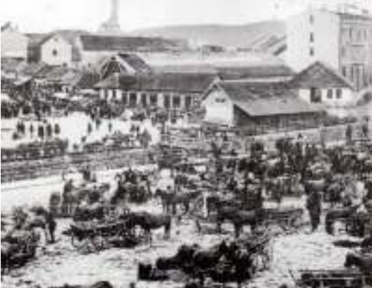
Photo 3 Banja Luka, watermills on the Vrbas River and Govedarica Market, the end of the 19th century

The manufacturing function in the waterfront becomes evident in the 19th century with the arrival of the order of Trappist who founded their monastery in the village of Delibasino Selo. They built the first electric power plant on the Vrbas river and several 376