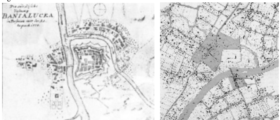
Photo 1/Banja Luka, the Map of the Kastel Fortress at the beginning of the 20th century and geodetic map of the city from 1884 with Big and Small Carsija /Source: https://www.google.ba/search?q=wagner+debes u Husedzinovic, S., Dokumenti opstanka

of the Vrbas River and which was inherited from the Roman times in the course of urbanization. This communication direction in the oriental times and in previous eras represented the backbone which was connected with construction thus creating a linear scheme around which separate parts were distributed." [7] Banja Luka was developed as the administrative, political and cultural center of the area of Bosanska Krajina. In the middle of the 19th century the city had more than 10,000 inhabitants and was the third largest city in the Bosnian Pashalik. Other traffic directions were crucially affected by the position of the Kastel fortress which is located between the Vrbas river and its tributary of Crkvena. The biggest cross communication runs through the fortress itself over the fortress bridge connecting the Carsija near the Ferhad-Pasha mosque with Small Carsija on the right bank of the Vrbas river.