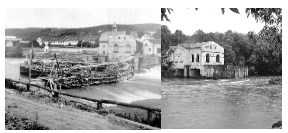
Photo 4, Construction of the power plant in Trapisti and its present condition

Cultural – historical goods represent the testimonies of the existence of men and human civilizations in time and space and are very important part of entire men's heritage and therefore the identity. Within the subject of the research the facilities of cultural and historical heritage are included. Certain facilities of the waterfront enjoy certain level of protection whereas most of the facilities which possess architectural, ambient and aesthetic qualities are not under protection. Industrial heritage is not recognized under this term in the Law on Cultural Goods. [16] There is the term Facilities of Technical Culture and industrial heritage facilities on two important locations have been reported in this Paper as such. The first is in the village of Delibasino Selo as a very valuable heritage and legacy of the first Trappist colony: the water tower, the mill, part of the brewery and the first power plant on the Vrbas River. The second protected facility of technical culture is the Steel and Iron Foundry Jelsingrad founded in 1936, now in the industrial zone. / Photo 4 /