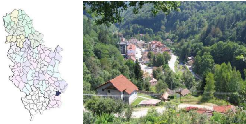
Figure 1. Geographic position of Crna Trava and the picture of municipality [3][4]

inhabitants. According to the number of people living here, only a few rural settlements stand out in a positive sense: Gradska, Preslap, Darkovce, Krivi Del and Zlatance.