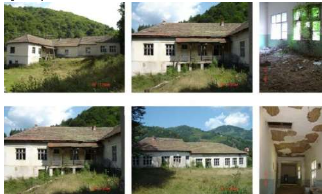
Figure 6. School in Brod today , source http://www.crnatravaprojekt.co.rs/index.php?option=com_content&task=view&id=23&Itemid=37 , accessed may 2009

After the reconstruction of the Saint Pantelejmon church in Brod, which is located near the school, wealthy individuals started the initiative for reconstruction of the school and for its new role as accommodation facilities. Inside the school borders were also monk cells, a dining room, workshops, etc. Unfortunately, this idea was dismissed, and the school was completely demolished in the meantime.