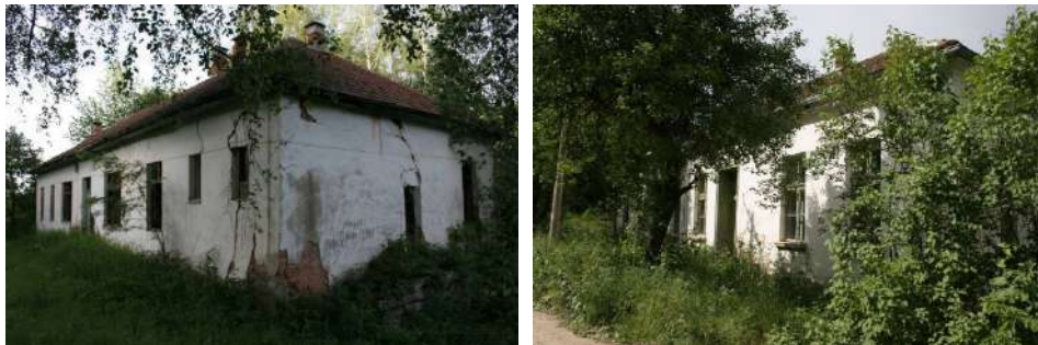
Figure 8. Abandoned schools - Jovanovci district

Other schools in the Crna Trava municipality are similar to these, by the size and the content.