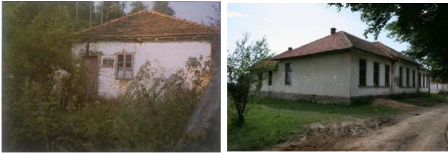
Figure 7. Old school in Mlačišće (on the left) and school today (on the right)

The school in Mlačišće was opened in 1920. It also included the teacher's apartment. The organized charity made it possible for a new facility to be built, which included three classrooms, a hallway, two apartments for teachers and an office. This school was unfortunately closed in 1978 because of the small number of students [14].