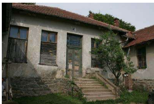
Figure 10. Mlačište - ex shop

The reintegration of school buildings that are decaying and losing their functions and changing them would increase the institutional capacity of the village that is otherwise in the majority of the settlements below the lowest level, which would raise the living conditions to a higher level and create a real base in the beginning to reduce and stop depopulation, and then for return, temporary or permanent, as well as for restoring certain contents, and then the villages themselves.