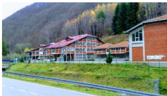
Figure 5. Technical school today

Masonry school tradition in Crna Trava lasts for almost one century. Between the two world wars, Crna Trava, among other schools, was almost without a single craft school. After the end of the First World War, by the decision of the Ministry of Trade and Industry, on 5 September 1919, a new masonry-stonecutting workshop was organized, and it worked from 1920 to 1925.