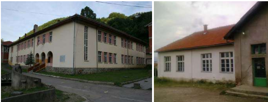
Figure 9. A positive example of a partial purpose alteration - the school in Crna Trava and district Zlatanci

Revitalization examples, although a few, almost always bring positive results. As mentioned, one of the rooms in the school in Crna Trava was given to a bicycle club "Orlovac", which is known for incredible results in and outside Serbian borders. The club uses this room as office space. Some of the classrooms in the technical school were repurposed into a masonry museum, where visitors could learn something about building techniques in this area, old tools which were used and objects that were built.