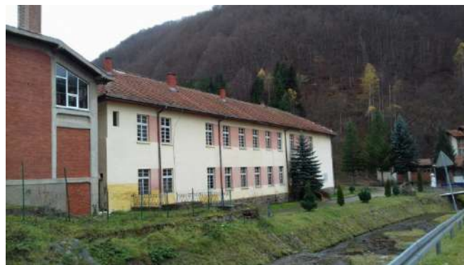
Figure 3. The school in Crna Trava today

In 1949 a new school was opened for the purpose of elementary education. The building had 6 classrooms, 324 m 2 , with three offices, a large hall, two apartments for teachers and a courtyard [8].