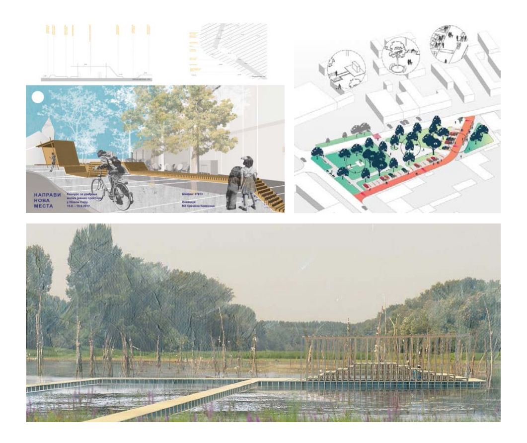
Slika 3. Winning proposals: upper left -"Linear bench + eaves" for the Zmaj Jova Square plateau in Sremska Kamenica, upper right - Drive-through marketplace (park and marketplace space in Kovilj), bottom-Pavillion/pontoon (south Dunavac riverbank)

Finding a solution throughout all aspects of the process of designing a space (from functional to visual): within financial and physical constraints, designer aspirations and requirements of numerous stakeholder groups is the main challenge of urban planning. Participative processes initiated by the Novi Sad ECC 2021 project anticipate new practices in urban planning, which are, sadly, used rather selectively. In contrast to the New Places project, other projects focusing on infrastructural projects do not meet even the basic requirements of sound architectural practice - finding the best solution through open architectural competition call. The participation process itself is, in some cases, formally conducted before, and in other, after the design procurement procedures have already been concluded, with the basis of project specification not reflecting the actual needs of the locality affected.