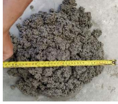
a) Photograph of slump