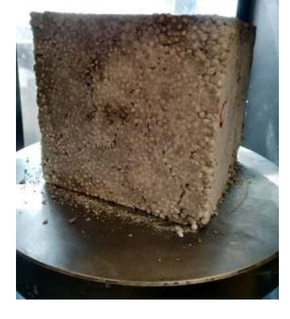
a) EPS1 specimen