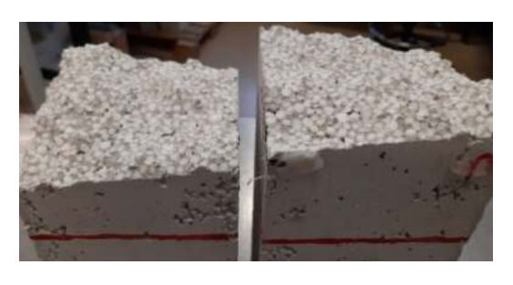
b) Failure surface