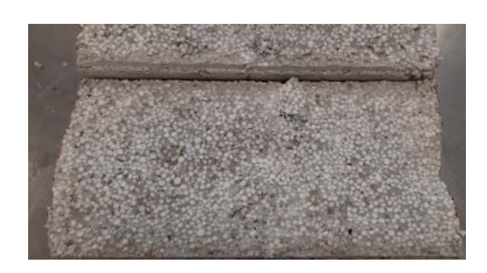
a) Typical failure mode