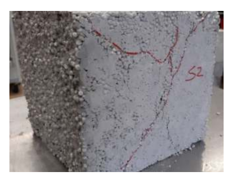
Figure 8. Compression test - failure patterns

The mean compressive strength of EPS3 LWC obtained on 150 mm cube and 200 mm cube specimens amounts 5.9 MPa and 5.3 MPa, respectively. Hence, an increase of the compressive strengths of 136% with respect to the EPS2 specimens was observed. Figure 8 represents the typical failure patterns observed after the compressive strength test. It can be seen that the shape of failure patterns visually corresponded to NWC.