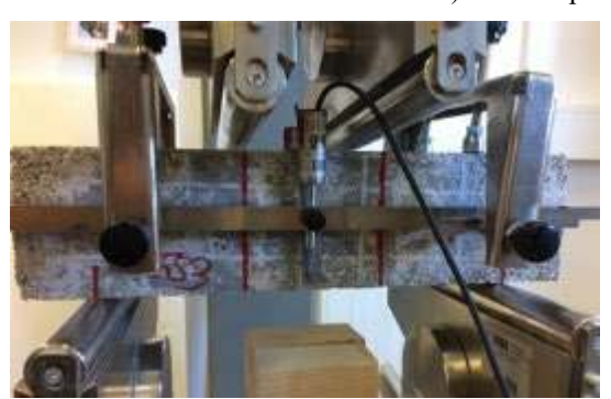
c) Flexural tests Figure 5. Test setup