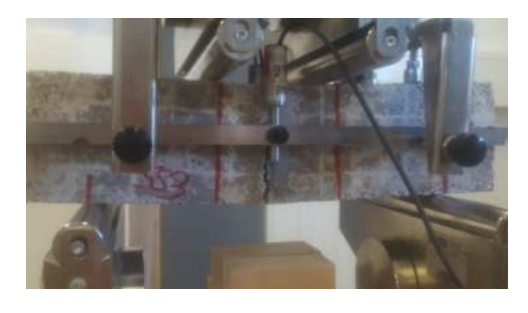
c) Crack initiation

There is not much information in the literature on the post-peak response of EPS LWC. Therefore, in this investigation, the load-displacement curves obtained for each prism are presented in Figure 11. It is interesting to observe that curves show straight pre-peak line while the post-peak response is more gradual. This result leads to the conclusion that EPS3 LWC did not have a flexural brittle behavior typically associated with the NWC.