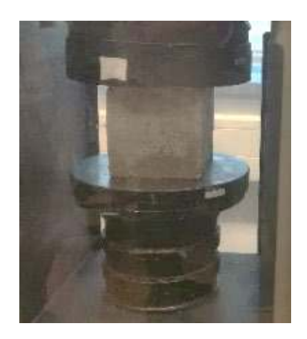
a) Compression tests

employing servo-controlled hydraulic machine with a maximum capacity of 300 kN. The tests were performed with the displacement control. Two Linear Variable Differential Transducers (LVDT) were used for measuring central point displacement, each on the middle of the longitudinal side of the beam as shown at Figure 5c. The loading and mid-point displacement of all three specimens were recorded during the experiment.