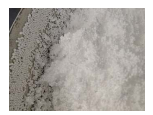
Figure 1. EPS beads