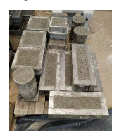
Figure 4. EPS3 concrete specimens