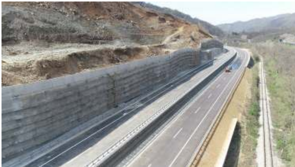
Figure 4 Formed landslide on the slope 1

In the meantime, additional geotechnical fieldwork, exploratory works and exploratory wells were carried out in which inclinometers and piezometers were installed, as well as an appropriate laboratory tests which were the basis for study which has served like one of the substrates to access the rehabilitation and stabilization process subject slope. Based on the results obtained geotechnical results, engineering-geological ground mapping and defined spread of the colluvial process on the slope, registered landslides elements (scars, jumps, belly, crack sand similar), it has been defined mechanism of the process which has served like basis for static analysis and slope stabilization problem solving.[4:1-2] Activities listed have caused prolongations of the completion deadlines and work price increase. Previous testing and exploring were not enough good analyzed hazard occurrence on subject location, and therefore the risk could not be analyzed, so it was not evaluated that sliding will occur. Parallel with work performing on the slope 2, the works on the slope 1 are performing also. It is about the same problem, so by original design solutions (supporting structure from micro piles with geotechnical anchors) it could not get the permanently solution. Unloading of the work and reinforcement of the slope with protective nets and anchors is carried out (Figure 4).