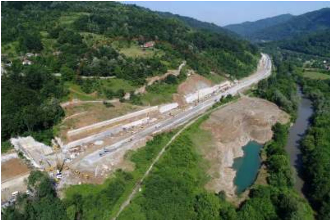
Figure 2 Formed landslide on the slope 2

Realization of this variant solution is constructed through the phases. Based on previously collected data, designing has begun and afterwards and performing. Immediately after works completion it has come to the stability disruption of conditionally stable slope and landslide activation just in front of the tunnel (Figure 2). Formed landslide was threatening the highway route, performed slopes and support structures but also structures beyond expropriation on the slope.