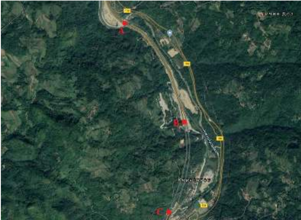
Figure 1 The subject road

Realization of this variant solution is constructed through the phases. Based on previously collected data, designing has begun and afterwards and performing. Immediately after works completion it has come to the stability disruption of conditionally stable slope and landslide activation just in front of the tunnel (Figure 2). Formed landslide was threatening the highway route, performed slopes and support structures but also structures beyond expropriation on the slope.