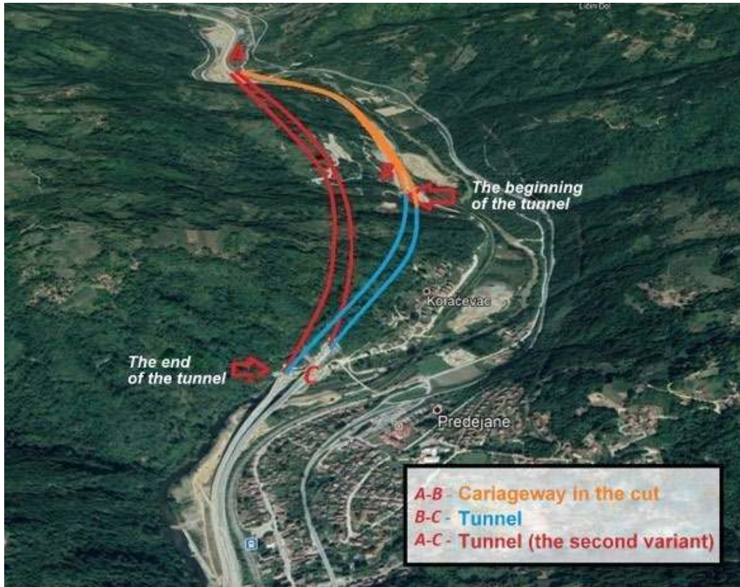
Figure 5 Tunnel tube extension

If at the beginning there were complete information about geotechnical substrate, probably it would be considered other variant solutions. It is possible that design solution, in the goal of optimality, could require also the road route correction (by situation and by height). Probably and final defined solution would be optimal, but that done in the beginning phase, in the high measure would eliminate additional costs due to the work extension, deadlock in design, and finally, direct income loss from previous road commissioning [2:202-203]. By analyzing previous listed problems related for wrong assessment and risk analysis, a conclusion is imposed that all happenings could be avoided by tunnel tube prolongation from the point A to the point C (Figure 5).