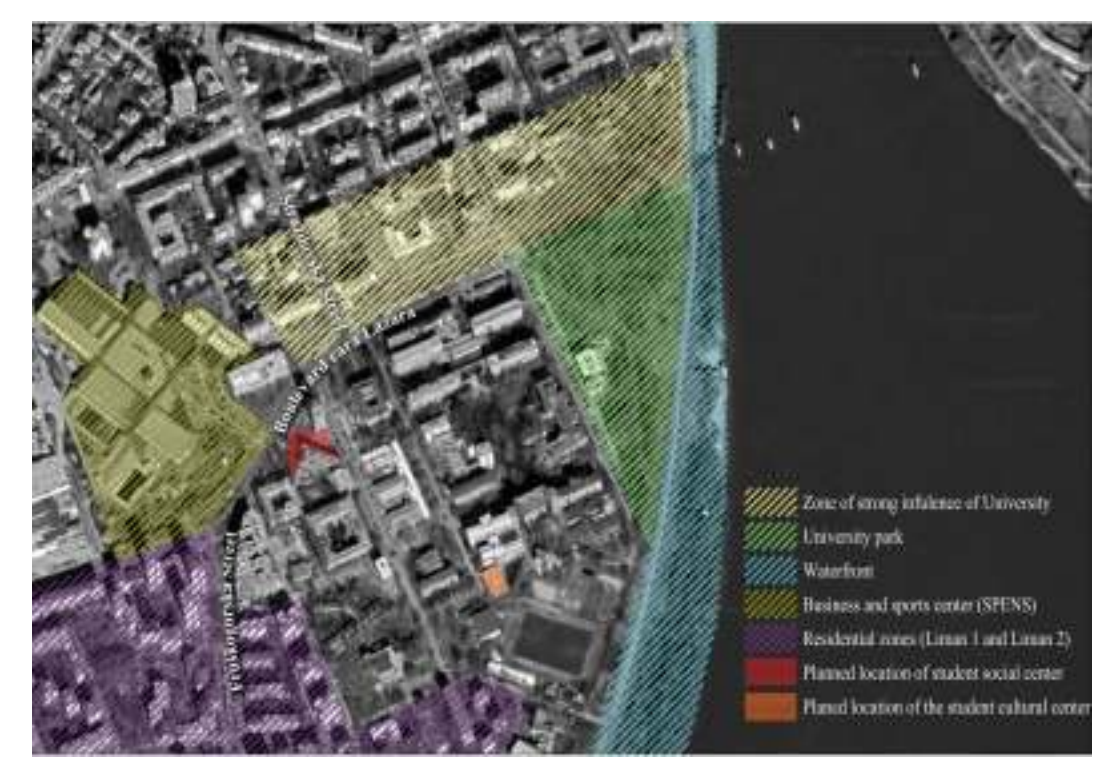
Figure 3 Surrounding of the university campus

To a lesser extent, the influence of the proximity of the university is also visible west and south of the campus in residential zones of Liman 1 and Liman 2. A great opportunity could also be achieved by better integration of the campus and the waterfront since the nearness of the river is currently not exploited. Despite the fact that the campus is located on the very bank on the Danube River, its link to the embankment does not exist. Walking path along the Danube attracts a large number of people during the day and especially in the summer evenings and for the last few years it became a place for a gathering of youth. Landscaping of the park, as a contact zone, would improve conditions for students, and other citizens of Novi Sad – better connection between the river bank and the campus would mean better city-river connection, too.