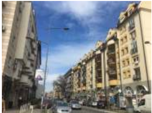
Figure 2 Left: View of Stražilovska Street and the University in Novi Sad (1968). Right: View of Stražilovska Street (2020)

Even though the campus has an inner-city location, morphologically it is more of a greenfield type, with freestanding structures surrounded by green areas creating pleasant microclimatic conditions. Nowadays, the university complex is almost fully completed as a whole, but the open plan of the university grounds offers some spaces still to be built. There are also some older structures which can be demolished and replaced by new ones with larger volumes and capacities, in order to fulfill ever-rising demands for space enlargement of contemporary educational and scientific activities as well as development plans of the University of Novi Sad.