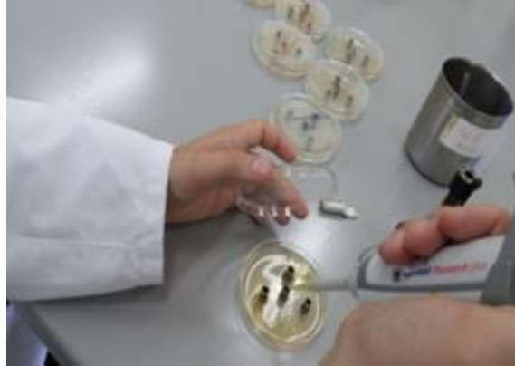
Picture 1. Disk diffusion test

For examination of antibacterial activity of White lily extract reference culture Escherichia coli WDCM 00090, Listeria monocytogenes WDCM 00020, Salmonella typhi WDCM 00030, Salmonella enterica WDCM 00030, Pseudomonas aeruginosa WDCM 00024 (BCCM™/LMG BACTERIA COLLECTION, Belgium) were used and isolated from culture collection of Laboratory for Microbiology of Veterinary Institute “Dr Vaso Butozan“ Banja