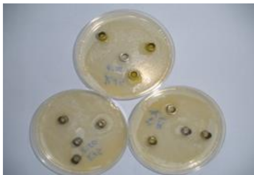
Picture 2. Reading the results