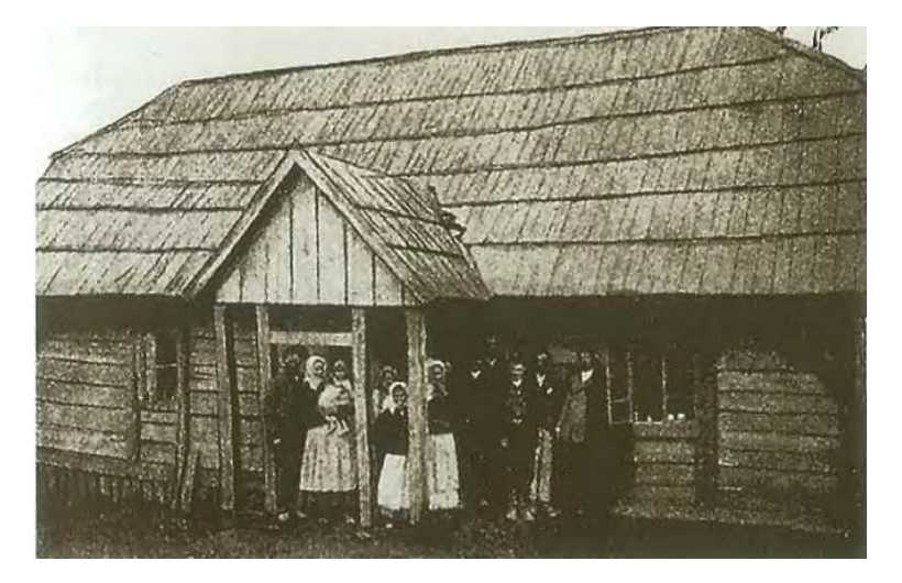
Figure 2. Peasant house in Devetina where holy mass took place in 1902 [5:471]

The Polish parish of Rakovac was founded after the secession from the parish of Prnjavor. The parish was founded on 6 May 1901; the parish patron was the Lady of Mount Carmel. The Polish immigrants built the church 10x6 m large, even before the parish was founded. The church was devoted to Saint Stanislaus, the bishop. The wooden church was replaced by a solid building in 1937, but it was demolished in 1945.