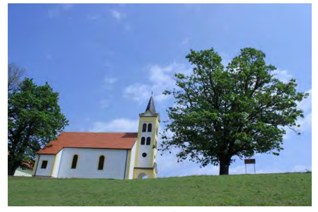
Church of Saint Michael the Archangel, Čelinovac: view from the west