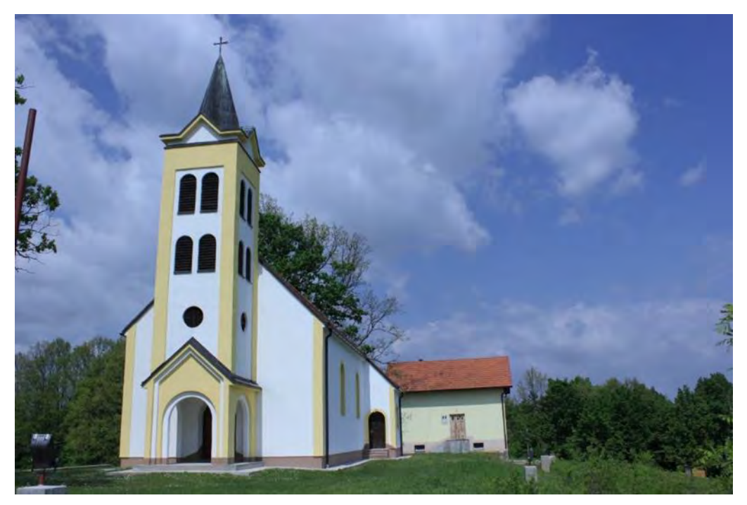
Church of Saint Michael the Archangel, Čelinovac: view from the south

Inside, above the entrance, there is a gallery, which rests on two pillars. The ceiling is flat, made out of wood, and tapered at the ends. The altar area is rectangular, embedded within the rectangular base of the church, without the projection of the façade. The church has a bell, inscribed with the year of 1922.