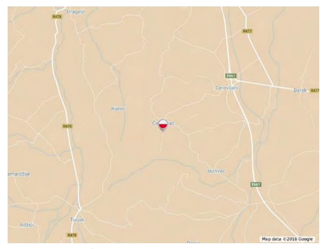
Figure 1. The site of Čelinovac within the surrounding of local settlements Cerovljani and Turjak [4]

Architectural styles and their properties in the majority of churches belonging to national minorities was far away from contemporary architecture at that time, but still in close link to their homeland and local customs in places from where they originated.