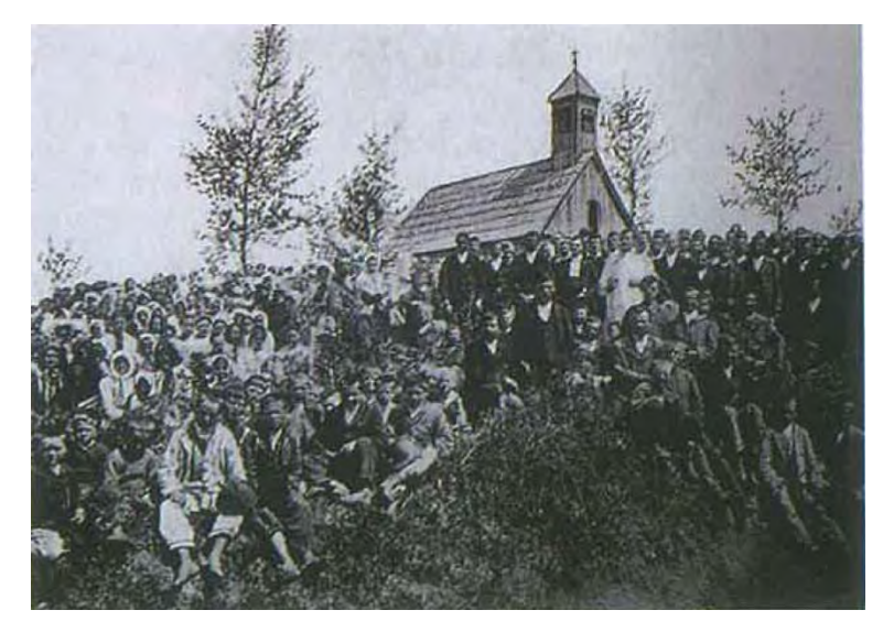
The church of Sinless Conception of Blessed Virgin Mary in Novi Martinac, photo taken in 1903 [5:487]

The parish in Novi Martinac was founded in 1900. It included primarily the Poles in Novi Martinac, Kličkovo Brdo, Zagreblje, Gumjera, Svinjar and Razboj; as early as in 1935, it included 17 sites with the Roman Catholic congregation. The parish patron was Our Lady of Snow. As soon as in 1900, a small wooden church was built, but replaced in 1906, with the church built out of solid materials. The church was devoted to the Sinless Conception of Blessed Virgin Mary. Similarly to other Polish parishes, this one was demolished, too, along with its sacred buildings, during and after WWII.