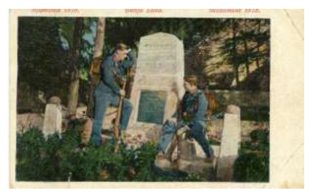
Figure 9. Another monument devoted to Austrian soldiers, unpreserved and unknown location [9]

In the preserved archival photographs, another monument, with similar design and proportions like the preserved one, but with rather smaller dimensions, can be seen. Unfortunately, it can be only guessed where it was located, because building references on the photos are not visible and all available maps do not show it as well. Some assumptions lead to places like Roman Catholic Graveyard Saint Mark, northern from Kaiserstraße , or the courtyard of the Tobacco factory as the possible site of this, later obviously, demolished monument. [1:182]