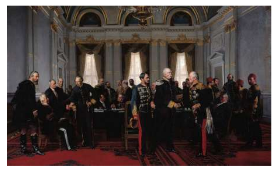
Figure 1. Anton von Werner, Congress of Berlin (1881): Final meeting at the Reich Chancellery on 13 July 1878, Bismarck between Gyula Andrássy and Pyotr Shuvalov, on the left Alajos Károlyi, Alexander Gorchakov (seated) and Benjamin Disraeli [2]

Without pretensions to simplify one of the decisive periods in the Balkans' history – XIX century, the century when the Ottoman Empire lost its power over this region, and many other interlinked events, here will be pointed out only the Treaty of Berlin, reached during the Congress of Berlin, happening between June 13<sup>th</sup> and July 13<sup>th</sup>, 1878. It was actually the revision of the Treaty of San Stefano from March 3<sup>rd</sup>, 1878, where the Russian and Ottoman Empire were the signatories. [1:45]