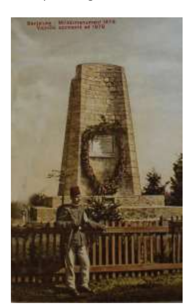
Figure 5. Monument devoted to Austrian soldiers fallen in 1878. Postcard issued in 1910. [1:181]

Carefully selected location of the monument in the Rudolf-Weiler Park , at that time green area with parks and distinctive forests surrounding a number of military buildings gives a brief insight into the importance of the monument itself to the military authorities. Even though such fact is not recorded in the historical documents, analyzing the repetition of this monument in photos and archival records, and the non-existence of anything similar elsewhere in Banja Luka, it can be concluded that this monument was the central monument erected for fallen soldiers in the occupation fights.