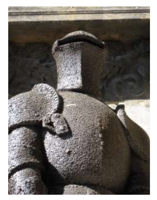
Figure 7. Close-up view of the "Wehrmann im Eisen" in Vienna, showing the nails

The monument in Banja Luka was designed as a Classic Revival tent-shaped canopy, probably 3 to 3.50m high, with the wooden knight installation inside. It was placed on a stone-made pedestal with lateral staircases. Later on, in 1918 the statue was removed, but the outer structure was kept until 1928. [1:185]