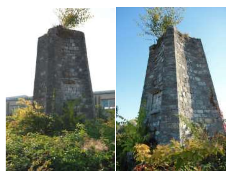
Figure 10. Present-day state of the monument devoted to the fallen soldiers from 1878

"People see what they want to see and what people want to see never has anything to do with the truth." Roberto Bolaño