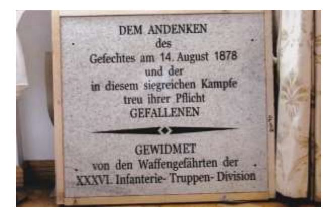
Figure 6. Memorial plaque donated by the ÖSK to the City of Banja Luka in 2010 [8:31]

Neither the monument nor its surrounding have been cleaned and maintained for decades, which resulted in absolute deterioration with significant constructive and aesthetical damages. Both pedestal and the obelisk are in the state of self-destruction with strongly enrooted trees and bushes growing out from the missing beds and perpends. Moreover, the plaques are removed and their exact inscriptions remain unknown.