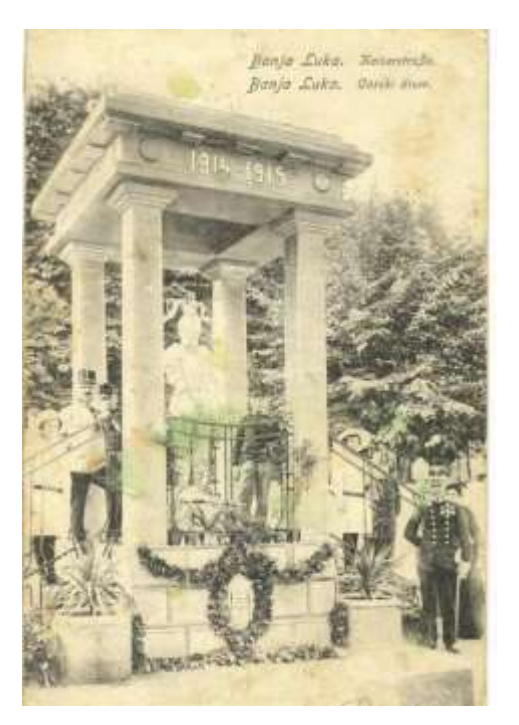
Figure 8. Knight in Steel; close up view. Photograph was taken probably during the opening ceremony on 18 August 1915 [9]

The monument in Banja Luka was designed as a Classic Revival tent-shaped canopy, probably 3 to 3.50m high, with the wooden knight installation inside. It was placed on a stone-made pedestal with lateral staircases. Later on, in 1918 the statue was removed, but the outer structure was kept until 1928. [1:185]