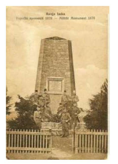
Figure 3. Monument devoted to Austrian soldiers fallen in 1878. Unknown date, photograph most probably taken before WWI [1:181]

Monument is located between modern-day Bulevar vojvode Petra Bojovića and Ulica Olimpijskih pobjednika, which once corresponded to Exercierplatz , in the vicinity of former Military hospital complex – modern-day Park Mladen Stojanović, and Military campus Vrbas, which is today University of Banja Luka campus.