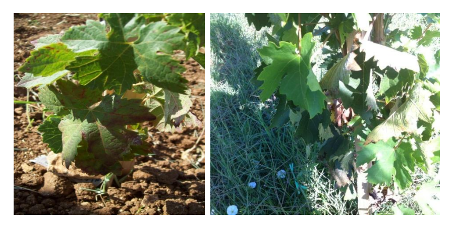
Fig. 2. Phytoplasma-like symptoms observed Примећени симптоми налик зарази фитоплазмама

During the survey for the phytoplasma presence, plants that were negative for infection with four viruses in DAS ELISA test were additionally examined for the presence of phytoplasma symptoms. On some black grapevine varieties symptoms such as leafrolling and partial vein reddening were noticed (Fig. 2).