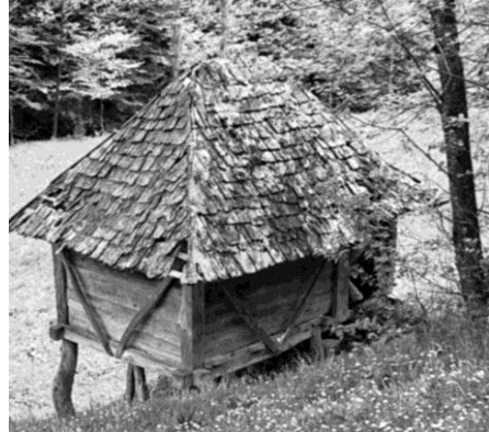
Fig. 9. A watermill on the stream (Makovište village)