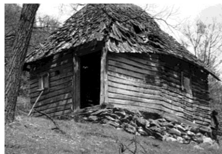
Fig. 5. A log and stone cabin Колиба од дрвета и камена