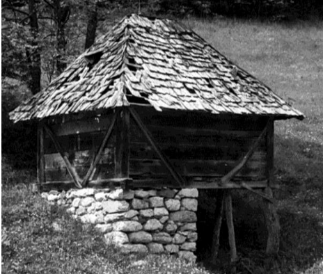
Fig. 8. A watermill on the stream (Makovište village)