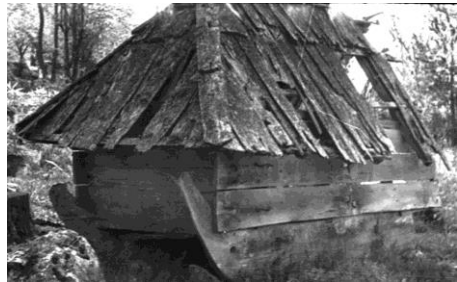
Fig. 7. "Kučer" (the Povlen Mountain) Кућер (планина Повлен)

Колиба прекривена сијеном (село Брајковићи)