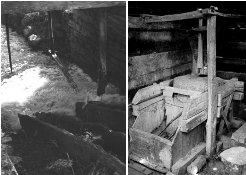
Fig. 15. A watermill's mechanism, lower (Godljevo village), upper (Makovište village) Механизам воденице, доњи дио (село Годљево), горњи дио (село Маковиште)