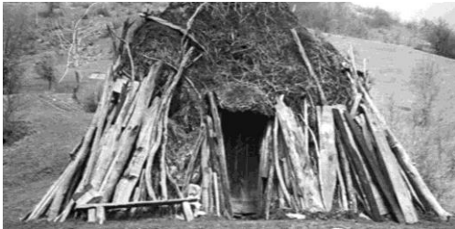
Fig. 2. A hut at the Povlen Mountain "Кулача" на планини Повлен

The roof cover is pressed by wooden branches (so the wind does not blow it up). Wooden branches (protection and for fire), which are constantly renewed are placed vertically around the building. There is only one two-part door on the building (small and large). The small door is closed during the day, the big door is closed at night (Figures 2, 3).