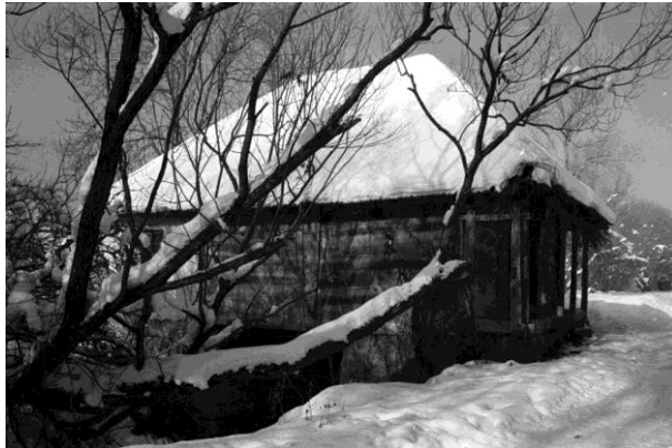
Fig. 14. A watermill, the lower course of the river (Kosjerić village) Воденица на доњем току ријеке (село Косјерић)

Several examples, within the entire width of the main facade, have a wooden porch. The corpus was built in two parts: wooden logs and filled skeleton. Wooden logs are connected at the corner („на ћерт“, „на унизу“). The skeleton section has walls filled by adobe, plastered and painted after. Roof construction is hipped, roof cover comprises clay tiles. (Figure 14).