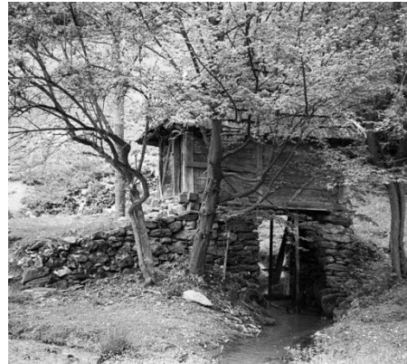
Fig. 11. A watermill on the stream (Pološnica village)