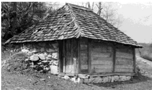
Fig. 4. The hut covered with shingles "На приковце", покривена шиндром

The hut ("на приковце") consists of a wooden skeleton and a filling inside. There are horizontally stitched slats (spaced 2-3 cm apart) on both sides of the skeleton. Clay mixed with straw and weeds is inserted between the slats. The wall has no additional surface treatment. There are doors and 1-2 windows on the building. The roof is hipped, covered by wooden shingles (Figure 5).