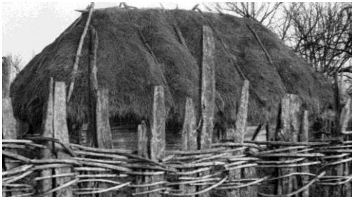
Fig. 6. A log cabin covered with grass (Brajkovići village)

There are doors on the narrow part of the building. The structure, the floor base and the (low) side walls are placed on the sledges. The roof is covered by wooden shingles (Figure 7).