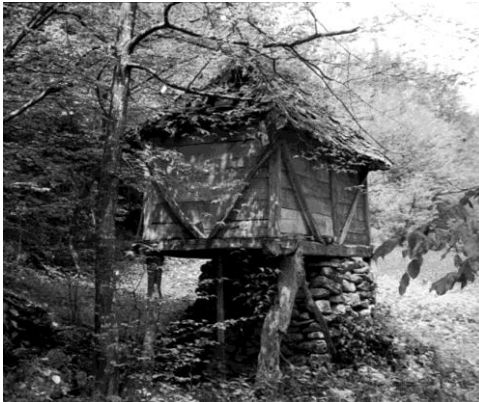
Fig. 10. A watermill on the stream (Ruda Bukva village)

The watermills (on the stream) are represented by a group of 6-7 buildings, collected in the villages on the Povlen mountain. The buildings stood alone (the Lužnica, Skrapež, and Rzav rivers) in long strings (the Pološnica river), or in a compact group (the Taor spring) at the original locations.