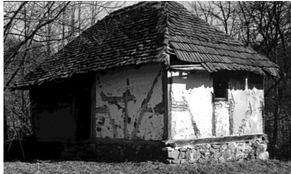
Fig. 13. A watermill on the stream (Godljevo village) Поточна воденица (село Годљево)

The water is supplied to the watermill using a pipe made of wood ("badanj"). The grinding mechanism is made of wood, the grinding mechanism stone is made in the villages in the vicinity of Valjevo city. (Figures 14).