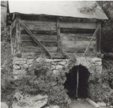
Fig. 12. A watermill on the stream (Godečevo village) Поточна воденица (село Годечево)

The second part of the base, where the watermill mechanism is located, rests on two wooden pillars (buried in the ground). The corpus of the building is made of wooden skeleton. The sprits attached outside of the corpus withstand horizontal forces. The walls are made in horizontal planks. The roof is hipped, the roof cover is wooden shingles or stone slabs. There is only one room inside the building providing space for a grinding mechanism, an area for miller and space for sacks (grain and flour). Underneath the grinding mechanism the floor is wooden (Figures 8-12).