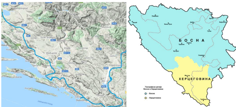
Picture 1. Geographical area of production of Herzegovina cheese in a skin sack (Brenjo, 2020)

When the production of the Herzegovina cheese in a skin sack is taken into account, it is very important to mention the Karst plateau Morine. It stretches for about 30 km east of Nevesinje towards Kalinovik, along a macadam road built during the Austro-Hungarian Monarchy, along the route of the old Roman road.