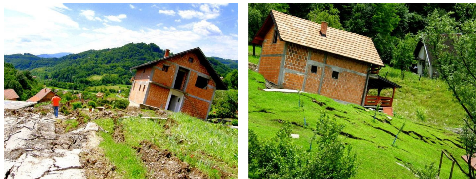
Figure 4 Demolition of houses in Suljaković, Municipality Maglaj – Bosnia and Herzegovina

Landslides negatively influence on morphology of surface of area and it can be seen in examples of landslides in Bogatići at Trnovo and also Suljaković near Maglaj [6]. According to the scale and catastrophic consequences, this landslide is one of the largest in BiH. During the construction of the M-17 there was already a landslide, which was then repaired. Landslide is certainly formed after recent rains. During the construction of houses, these were buried streams which are on the left and right sides of landslides. These streams were dragging surface water. Another cause is illegal construction. Cutting the slope at upper side of facilities, including leveling and filling from lower side, resulting imbalance of mass, disturb is natural balance conditions and then worst happens, figure 4.