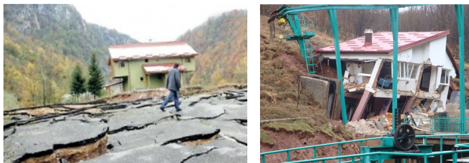
Figure 3 Landslide in Bogatići, Municipality Trnovo – Bosnia and Herzegovina

Landslides negatively influence on morphology of surface of area and it can be seen in examples of landslides in Suljaković near Maglaj and Bogatići at Trnovo [5]. One example of impact of landslides on forest vegetation is also landslide in Bogatići at Trnovo, which represents the largest and fastest landslide, figure 3.