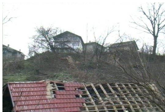
Figure 2 Landslide "Crvene njive" in Tuzla, Bosnia and Herzegovina.

The depth of the landslide is 10-12 meters and is related to the depth of burial clay layer that lies beneath the sand, figure 2.