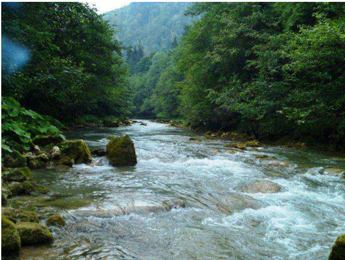
Figure 1. River Canyon Biostica in the upper reaches

One of the major tributaries of Biostica river is the left tributary Kaljina, which drains the northern slopes of Romanija and eastern slopes of Ozren, and it is positioned approximately 5 km upstream of the studied area of lead mineralization. Downstream from the confluence of the rivers Bioštica have no longer any left tributary mainly because of the karst nature of the terrain, Figure 1.