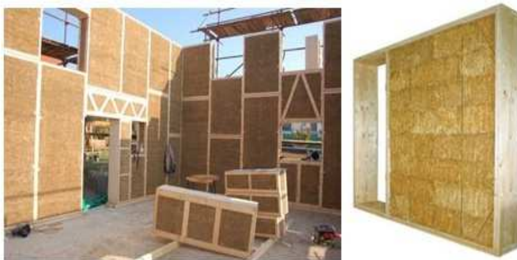
Figure 4. Ecococon panels

Precast panels , the next logical step in the development of traditional materials in a modern building and adapting modern technologies of construction. This is the development of modular panels with a wooden framed structure, where it is possible to build smaller buildings up to two floors, in Figure 4, [4,5,6].