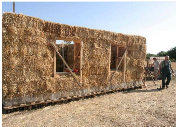
Figure 3. The house built by Lehel Horvat, Serbia

Individual straw bale construction , the method of construction, resulting from a traditional manual construction where, thanks to the use of mechanization in agriculture bale of straw blocks appear as suitable for construction, in Figure 3.