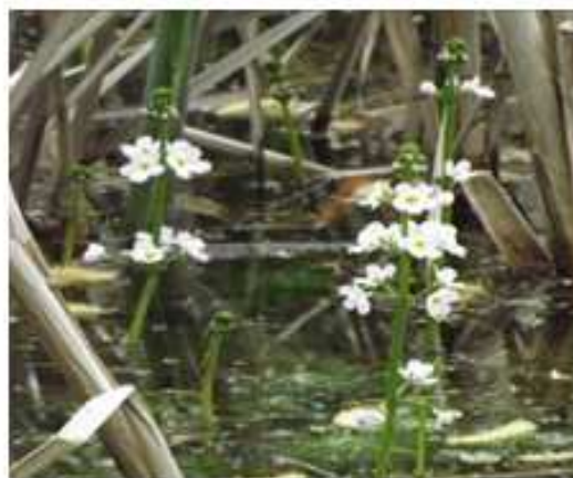
Figure 7. Hottonia palustris L.