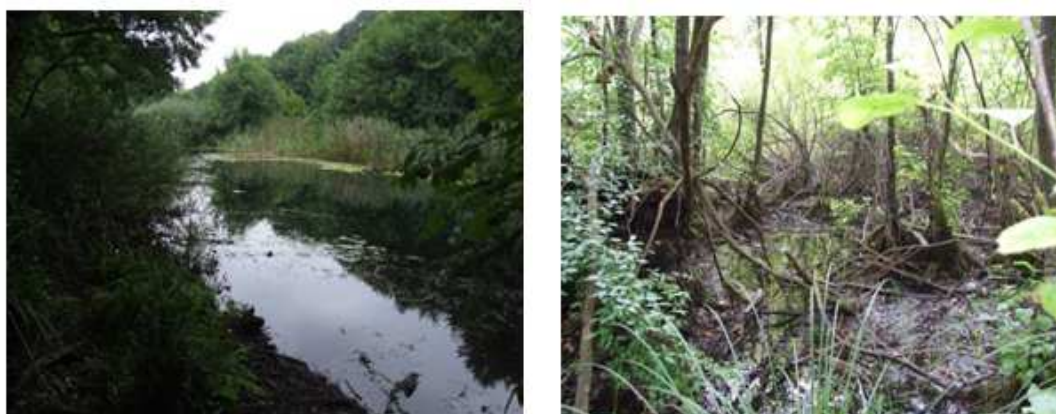
Figures 2. and 3. The depression of the Laketić source in which a peat bog and the relict hygrophilous community of Alnetum glutinosae Vuk. 1956.

These communities are formed on marsh land, which is a long float, and permanently under the influence of groundwater. According to physiognomy, the community Salicetum cinereae Zol. 1931. is a low, bushy often very dense community, where as supporting indicator species occur hydrophytes: Caltha palustris L. and Glyceria fluitans L. [26]. In the flooded part of the forest of black alder and ash trees the community Urtico kioviensis-Salicetum cinereae [25] appears in fragments. The land consists of various variants of wetlands, very humid (gley) substrate, which is long-lastingly under the influence of high groundwater. As a species that differentiates this community of wading willow trees the Urtica kioviensis Rogow has been taken, which belongs to the Pontic-Pannonian floral element [25].