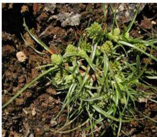
Figure 8. Cyperus michelianus (L.) Delile

Nowadays Hottonia palustris L. is an element of azonal aquatic vegetation in the moderate middle European climate, avoiding the extremes of the far north and the Mediterranean. According to Butorac [28] Hottonia palustris L. in BiH is in the category of vulnerable species (VU) by the IUCN. On the site along with this there are more species: Caltha palustris L., Sium latifolium L., Sparganium erectum L., Mentha aquatica L., Alisma plantago-aquatica L., Eleocharis palustris (L.) Roem & Schult, Juncus articulatus L., Butomus umbellatus L. et al. In the coastal region, the emerging vegetation is developed, dominated by Typha angustifolia L., Oenanthe aquatica (L.) Poir., Iris L. pseudacoris , Schoenoplectus lacustris (L.) Palla are sporadically occurring, and Phragmites communis Trin in small groups. On muddy surfaces after the withdrawal of water between emersion area and free water the individual samples of plant species Bolboschoenus maritimus (L.) Palla, Cyperus fuscus L., Pycreus rotundus (L.) Hayek, Sagittaria sagittifolia L., Myosoton aquaticus (L.) Moench can be noticed, specifically distinguished by the presence of the rare species Cyperus michelianus (L.) Delile (Figure 8).