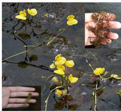
Figure 9. Utricularia vulgaris L.

The aquatic part consists of floating species: Lemna minor L., L. gibba L., Spirodella polyrhiza (L.) Schleid., Salvinia natans (L.) All. and Nuphar lutea (L.) Sm., and among submerged species Myriophyllum spicatum L., Utricularia vulgaris L. and Lemna trisulca L. This wetland is the habitat of rare insectivorous plant Utricularia vulgaris L. whose number depends on the presence of primarily zooplanktons (Figure 9). The aquatic community can be characterized as Myriophyllo-Nuphaeretum W. Koch 1926. As traces of warm tertiary and warm interglacial phases sub-Mediterranean plants Clematis flammula L., Diploxys muralis (L.) DC., Sinapis alba L., Valerianella coronata (L.) DC., Agrostis capillaris L. et al., as well as sub-Pontic/sub-Mediterranean species Valerianella dentata (L.) Pallich remained [29].