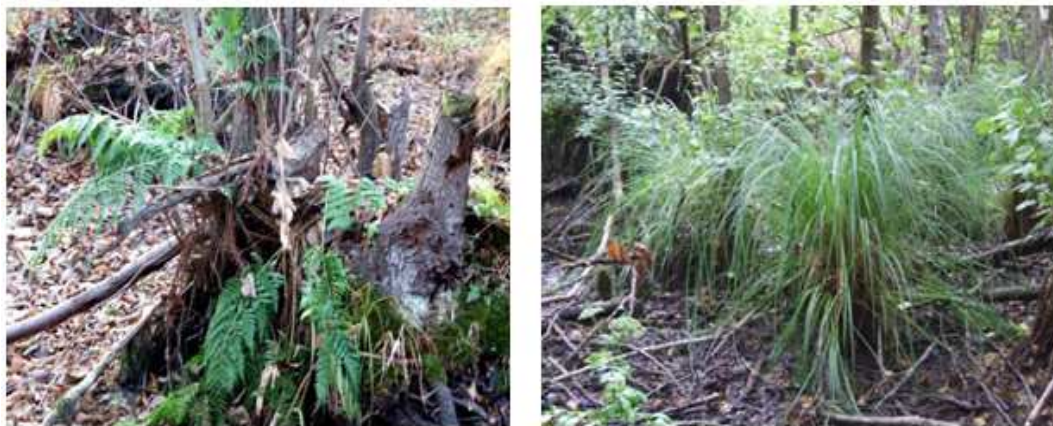
Figures 4. and 5. Marsh ferns species Thelypteris palustris Schott. and Carex pseudocyperus L.

the location of the Gromiželj turf forms may be seen, where, among the ferns, as a subdominant species Carex pseudocyperus L. appears (Figure 5) [25].