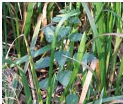
Figure 6. Urtica kioviensis Rogow

Black alder is present in the depressions around Semberije in the forms of small groups where they could establish peatland, but there are usually around them the complexes oak-ash forests that had been cut and thus the depressions with black alder remained as independent surfaces. Emergent band is made up of Typha angustifolia L. where the sporadic occurrence of Phragmites communis Tvin. can be noted on the contact of wood and peatland. This indicates the started vegetation succession in accordance with the mineralization of peat. A bulrush is the habitat of relict glacial period species Urtica kioviensis Rogow which is the Pannonian endemic species whose southern areal boundary ends in peri-Pannonian region (Figure 6). This nettle is the indicator species for lowland peat formed in the fossil river beds. In the flooded zone the whole area covered by species Hottonia palustris L. may be noted (Figure 7), which is an indicator species of wetland vegetation within the forest from the class Alnatea glutinosae . Its taxonomic and phytogeographic importance in the flora of the Balkans is that belongs to oligotype relict lineage Hottonia encompassing also vicar North American species of H. inflata Elliott. These distant phytogeographic relationships indicate the relic species i.e. its affiliation to the elements of arctoterciar aquatic flora.