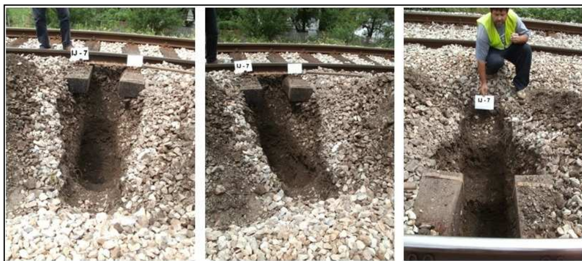
Figure 2a. Characteristic example of trench IJ – 7 on chainage km 105+450,00

Trenches were in detail mapped, photographed, figure 2a, and also were taken disturbed and undisturbed samples covered with the same material. Based on terrain mapping, results of laboratory tests, profiles of all trenches were made, figure 2b, as well as transverse profiles of the terrain along the route of the railroad.