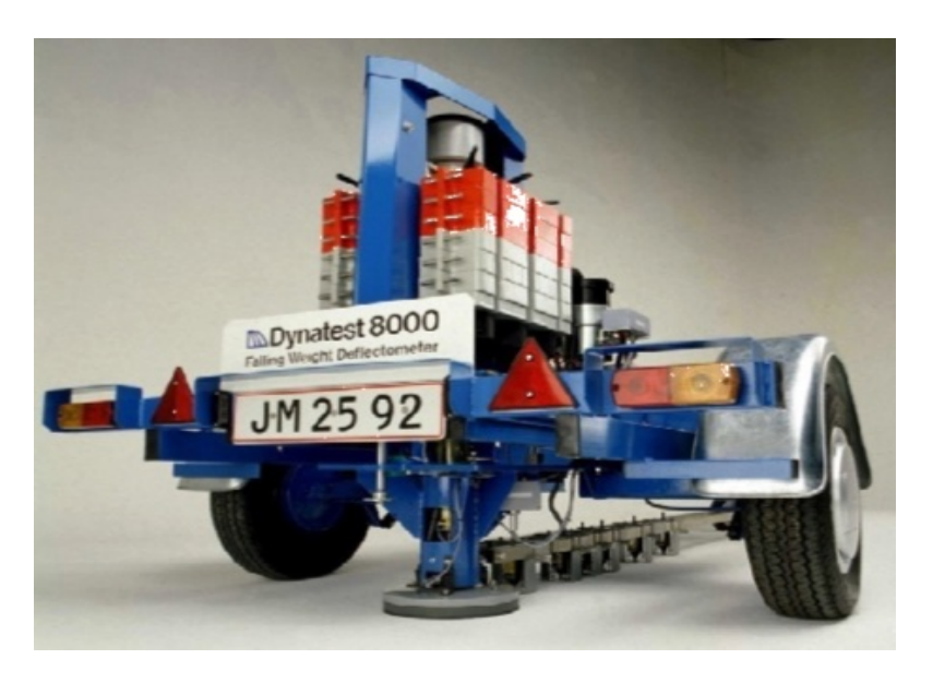
Figure 2. Dynatest 8000 FWD deflekcometer [9]

Data processing was performed using ELMOD 5.0 software package. Developed by Dynatest International A / S and uses an approximate method based on Boussinesq's Equations and Odemark's Equivalent Thickness Method for Estimating Layer Modules on the Deflection Database. Data processing, or "backcalculation", is based on the iterative procedure of calculating the modulus of pavement layers elasticity (figure 3).