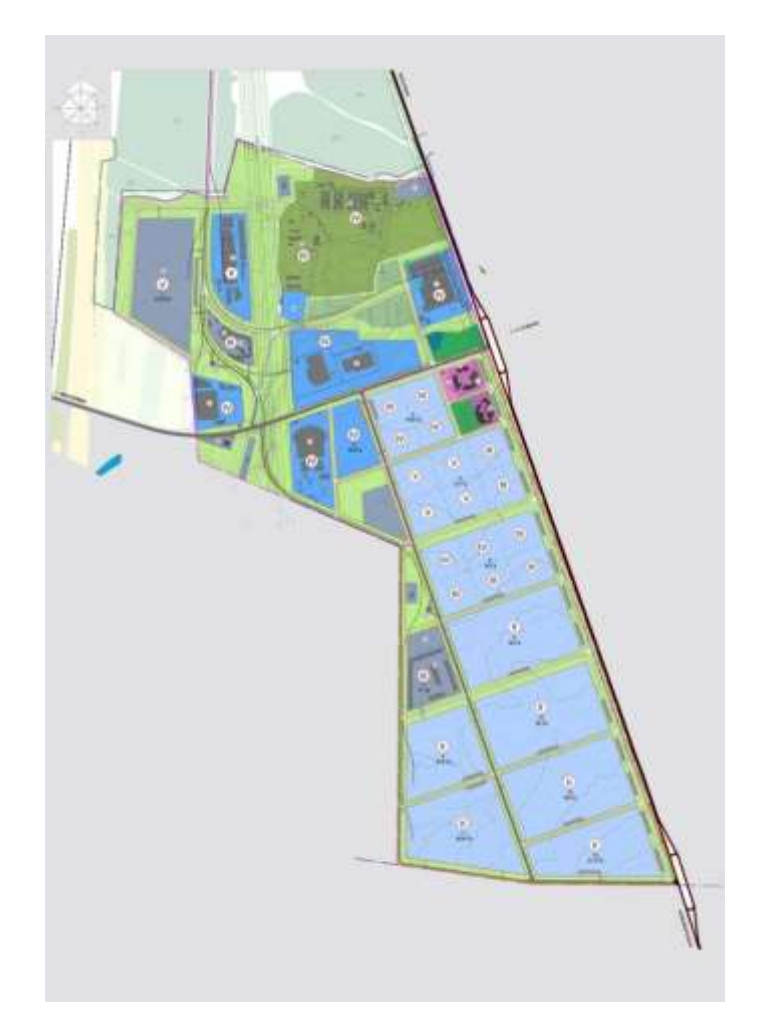
Figure 1 Existing project for planning the territory of the Maslovsky industrial park, functional zoning scheme

On the one hand, the practice of their functioning is being considered, new versions of the concepts of bills on territorial entities with special economic conditions of functioning (both in general and in particular special economic zones) are being developed [1,2]. On the other hand, SEZs cannot be considered exclusively from the legislative side, since aesthetic, architectural and urban planning factors also affect the attractiveness of territories for investors and the injection of investments [3]. On the example of the special economic zone of the industrial and production type "Center" (hereinafter - SEZ PPT "Center") in the Voronezh region, which was created in accordance with the Decree of the Government of the Russian Federation dated 30.12.2018 No. 1774, consider the development of this territory and its attractiveness from the point of view of urban planning and architectural aspects, Figure 1.