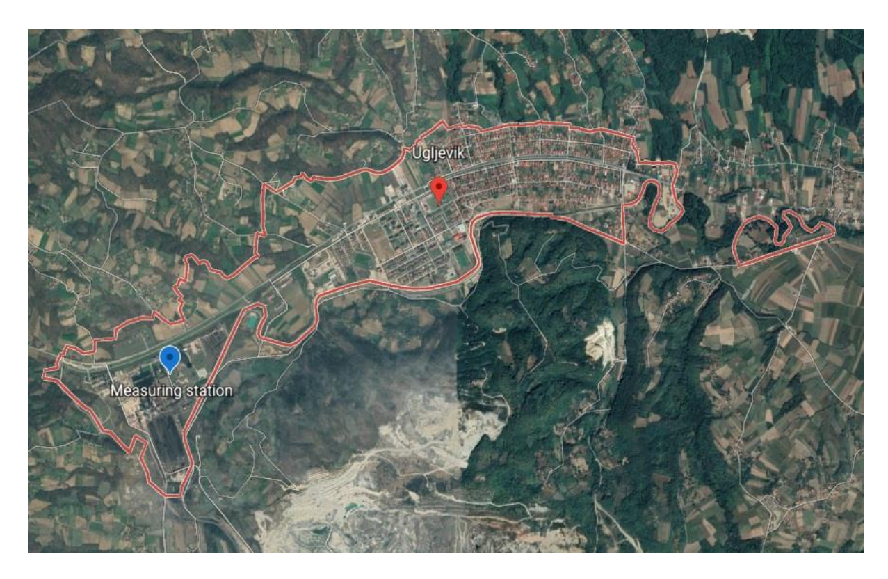
Figure 1. Location of the measuring station in relation to the town Ugljevik [9]