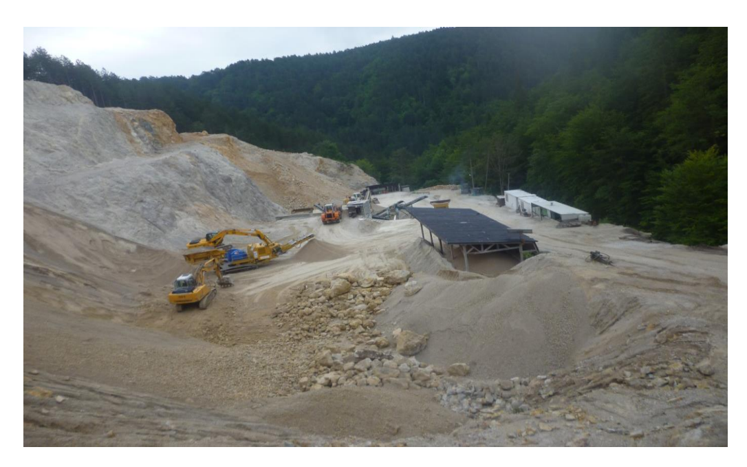
Figure 2. Panoramic view of the dolomite deposit Nikolin Potok (Forčaković Dž. 2022)