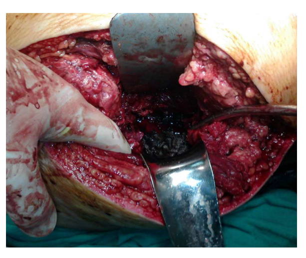
Figure 4. Altered gluteus maximus muscle color and consistency

In order to make decompression of the sciatic nerve, two-stage surgery was required. The first stage involved ligating the internal iliac artery that would prevent fatal arterial bleeding and the second stage involved fasciotomy and decompression of the sciatic nerve