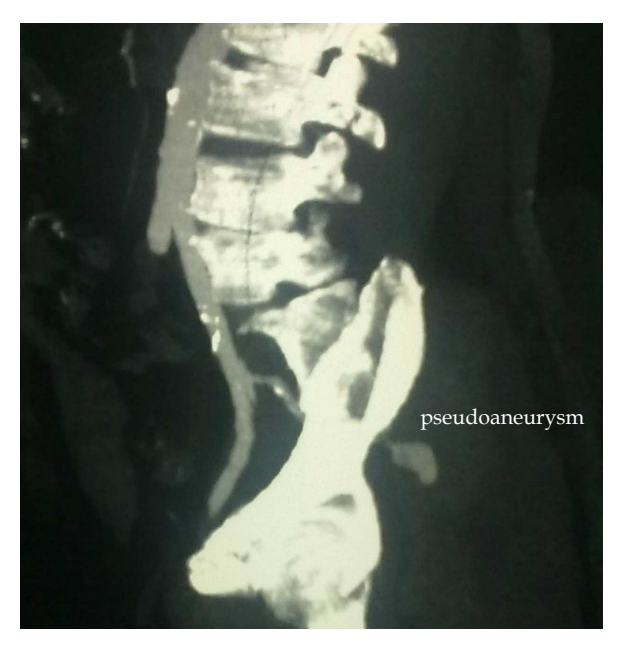
Figure 2. Computerized tomography: Lateral view of posttraumatic pseudoaneurysm of superior gluteal artery

ence range 0-205 U/L), high LDH 464 U/L (reference range 125-243 U/L). Just before the fasciotomy began, the Hbg level was 89.7 g/L, and a very low level of Hct 0.26 was registered.