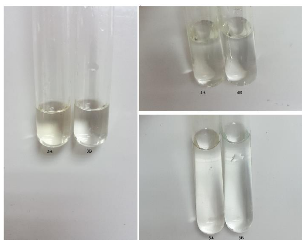
Figure 1. Comparison of the test solution (left: 3A, 4A and 5A) and standard solution (right: 3B, 4B and 5B) for samples 3, 4 and 5 having exceeded the limit of heavy metals

performed according to the procedure described in the Material and Methods section. By visual comparison of test solution with a standard solution containing the maximum allowed quantity of heavy metals, it was concluded that Samples 3, 4 and 5 have the brown color of solution more intense than the color of the standard solution (Figure 1). This indicate that Samples 3, 4 and 5 have exceeded the limits of heavy metals prescribed by Pharmacopoeia (max. 0.1 \text{ ppm} = 0.1 \mu\text{g mL}^{-1} ) for distilling water intended for pharmaceutical use (Table 1). The other samples (sample 1, 2, 6, 7, 8, 9 and 10) showed a significantly lower intensity of brown color compared to the standard solution, which means that the amount of heavy metals is less than 0.1 ppm, which is in accordance with the specification prescribed by Ph. Eur. 9.0 [2].