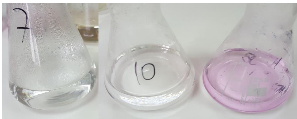
Figure 3. Display of Samples 7 and 10 after analysis of the presence of oxidizing substances in distilled water for pharmaceutical use