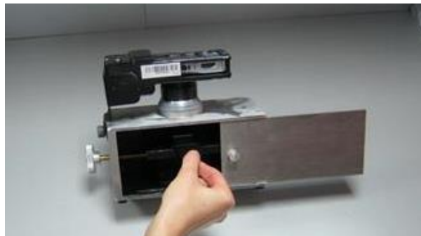
Figure 1. OMIS device

under the Brewster's angle and the second image of the sample is taken. Two images are processed with the convolution algorithm in MATLAB® 2013a (Math-Works, USA) and the optomagnetic spectra of the sample is obtained.